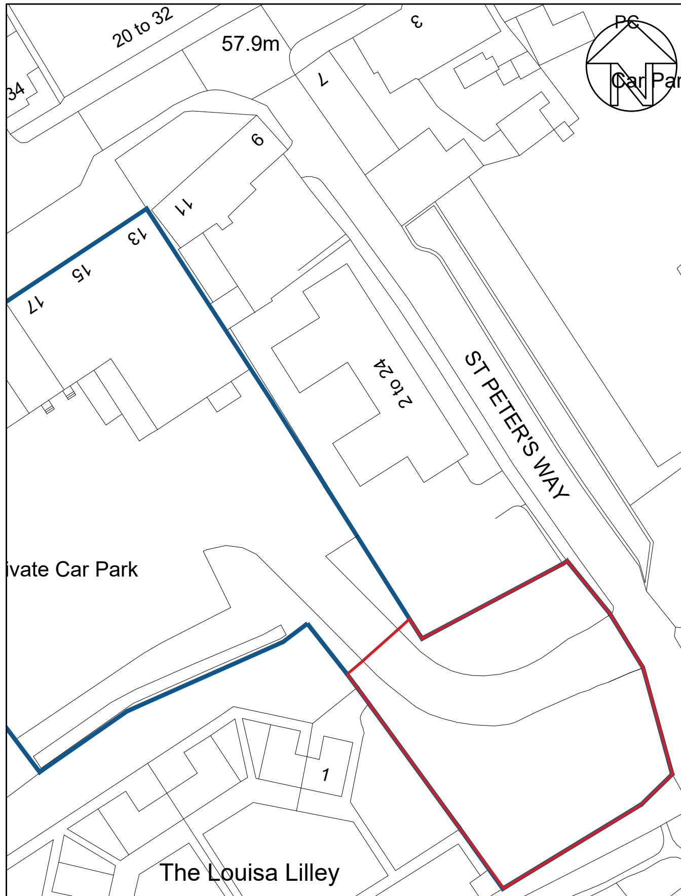
Site Block Plan 1:500