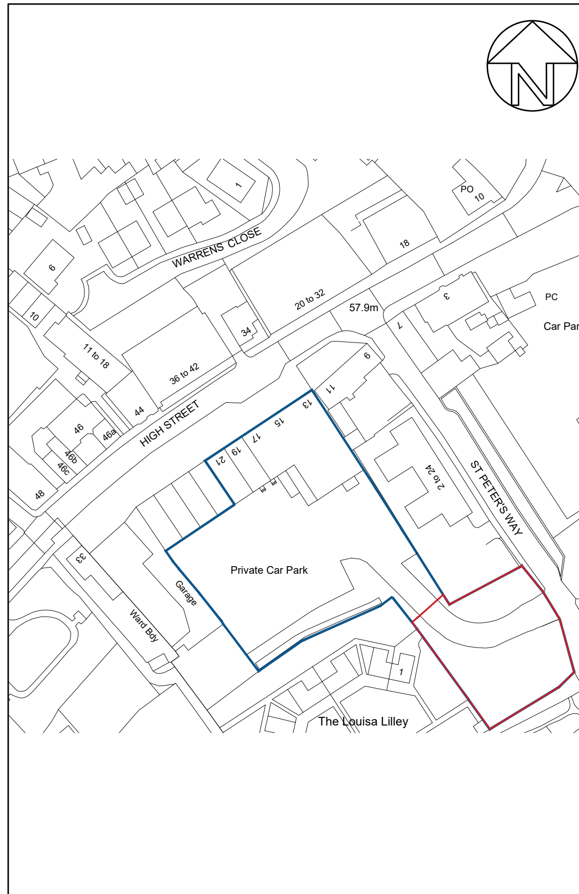
Site Location Plan 1:1000