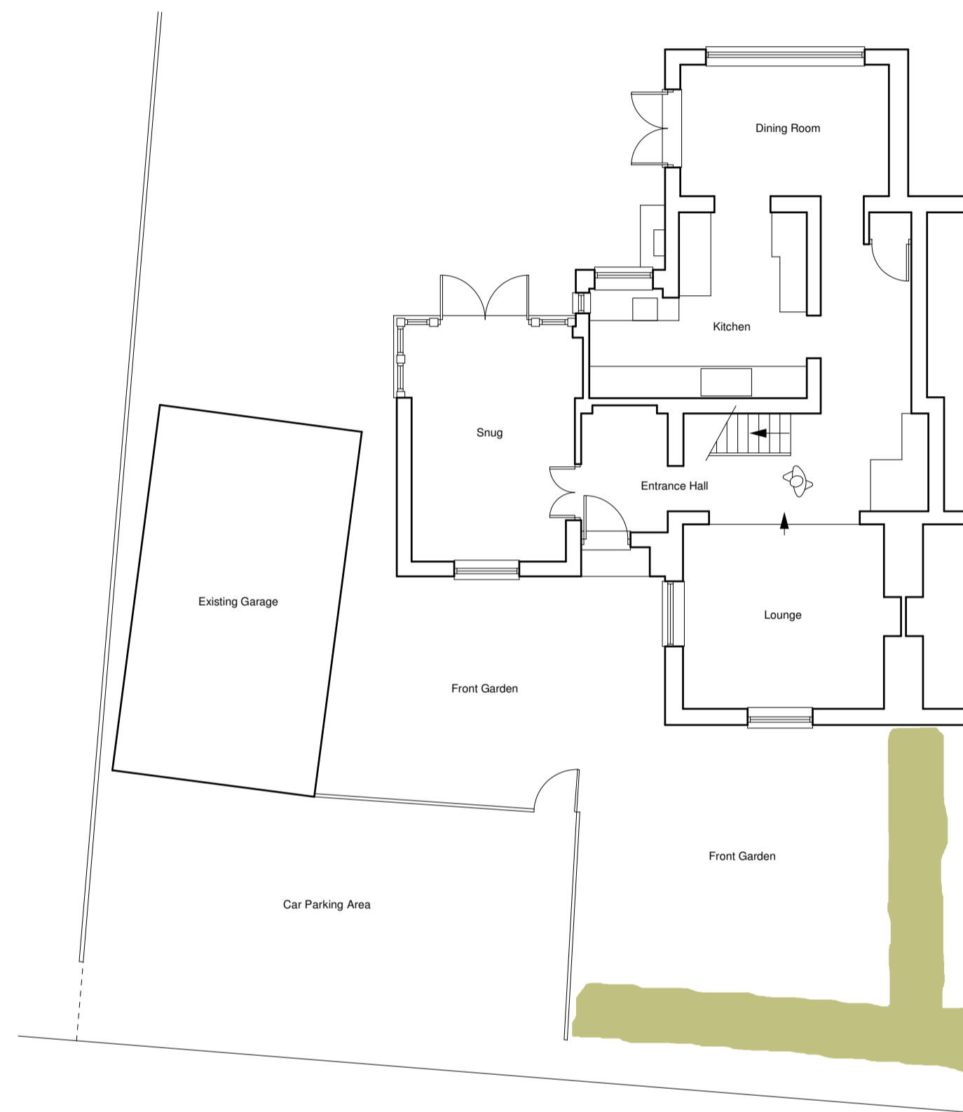
Existing Ground Floor Plan 1:100 @ A1