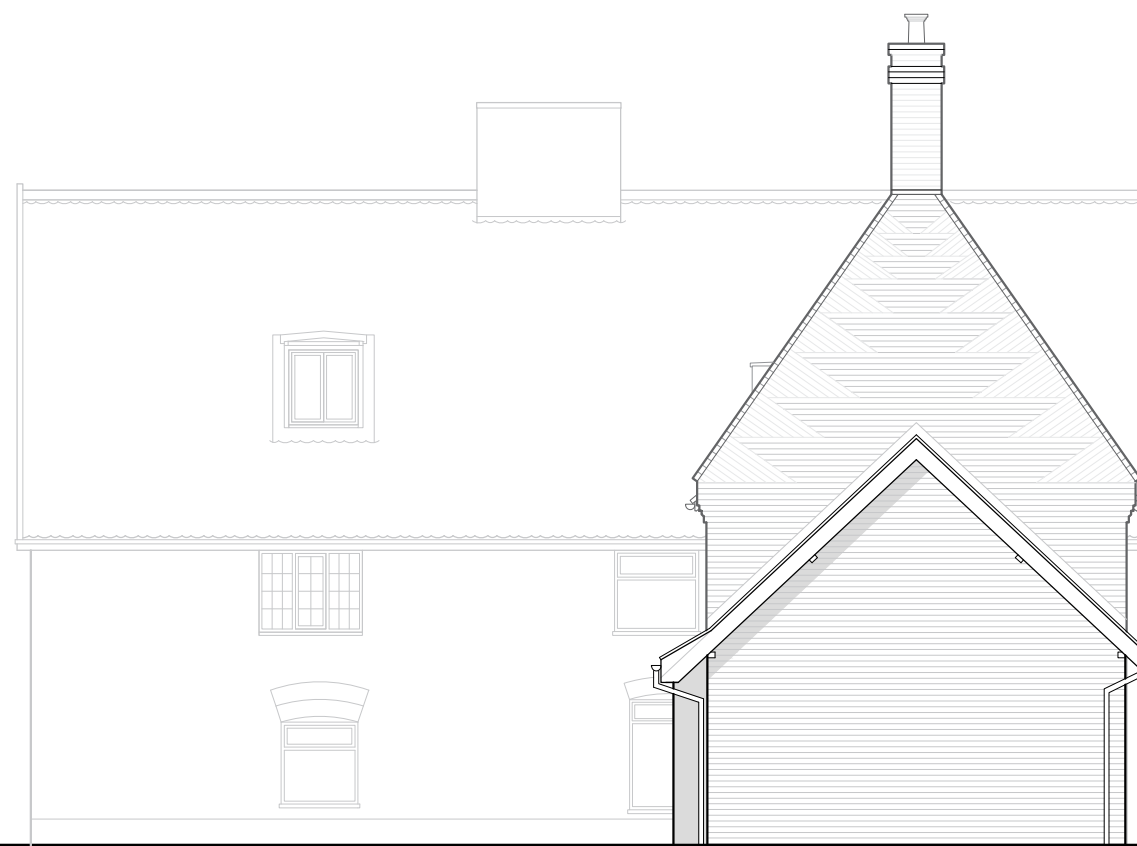
Existing South Elevation 1:100