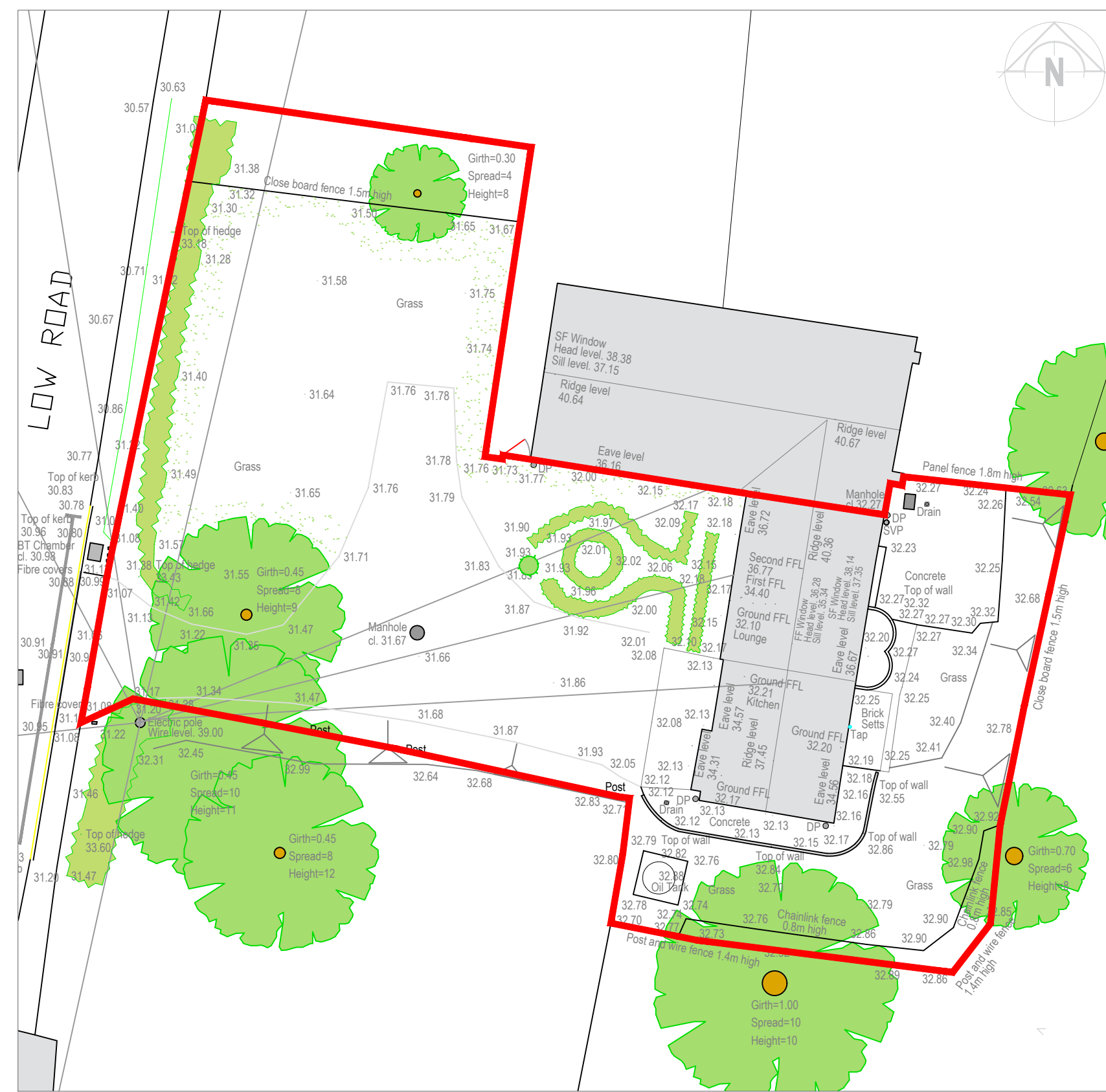
Existing Site Plan 1:200