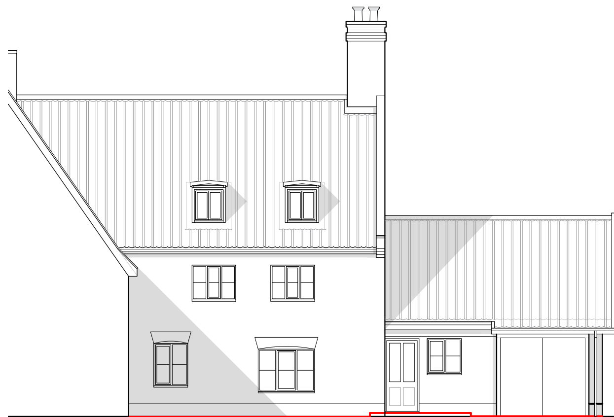
Existing West Elevation 1:100