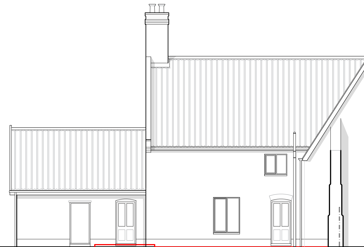
Existing East Elevation 1:100