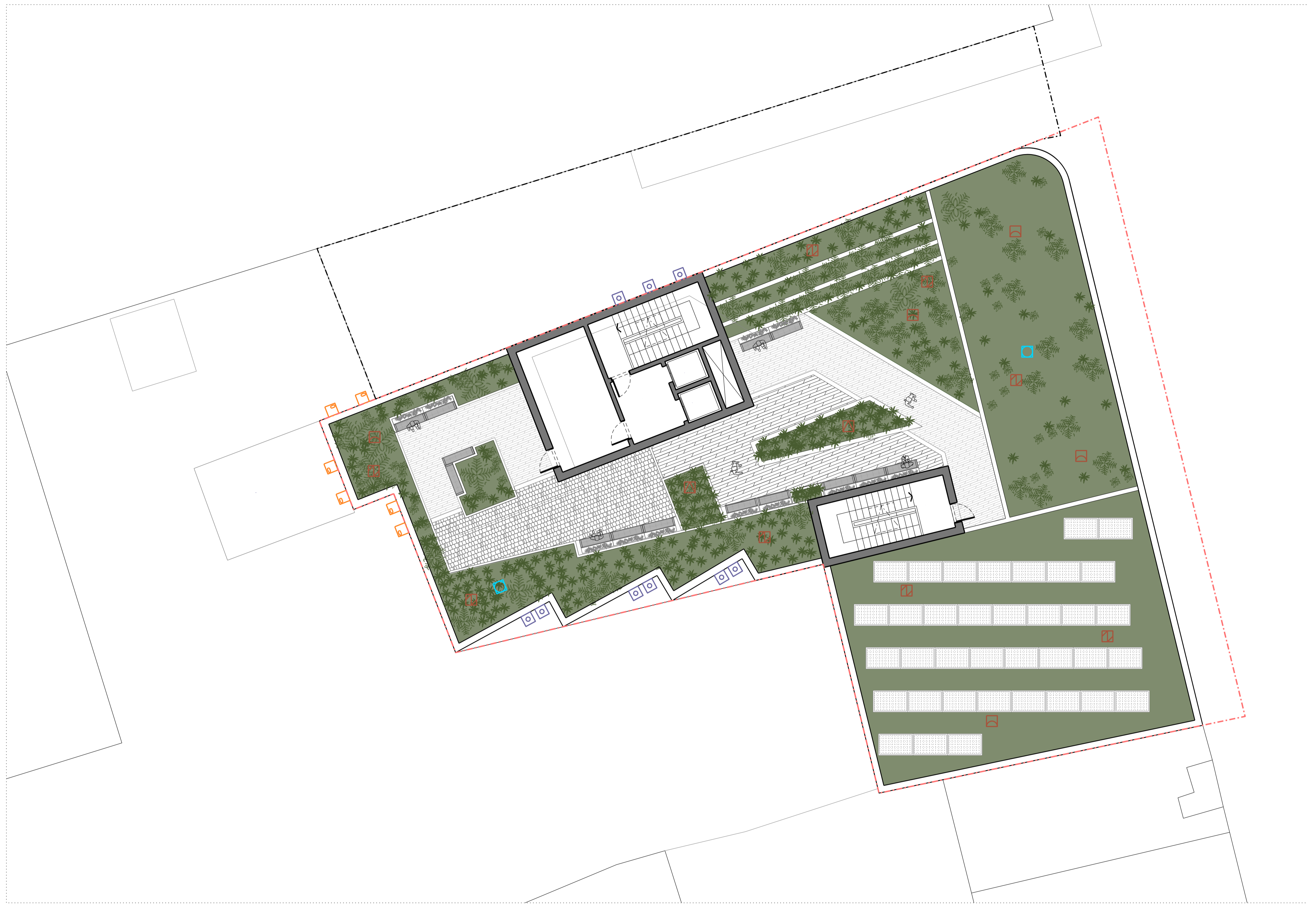
Proposed Roof Plan

KJC architects 44 Stafford Road, Wallington Surrey, SM8 9AA +44 (0) 20 3745 4405