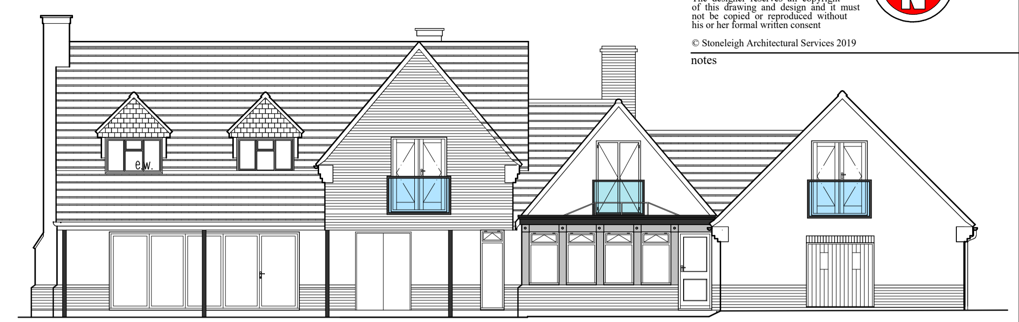
Rear elevation All existing doors & windows to be painted - colour TBC