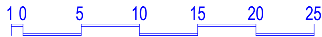
Scale in Metres 1:200