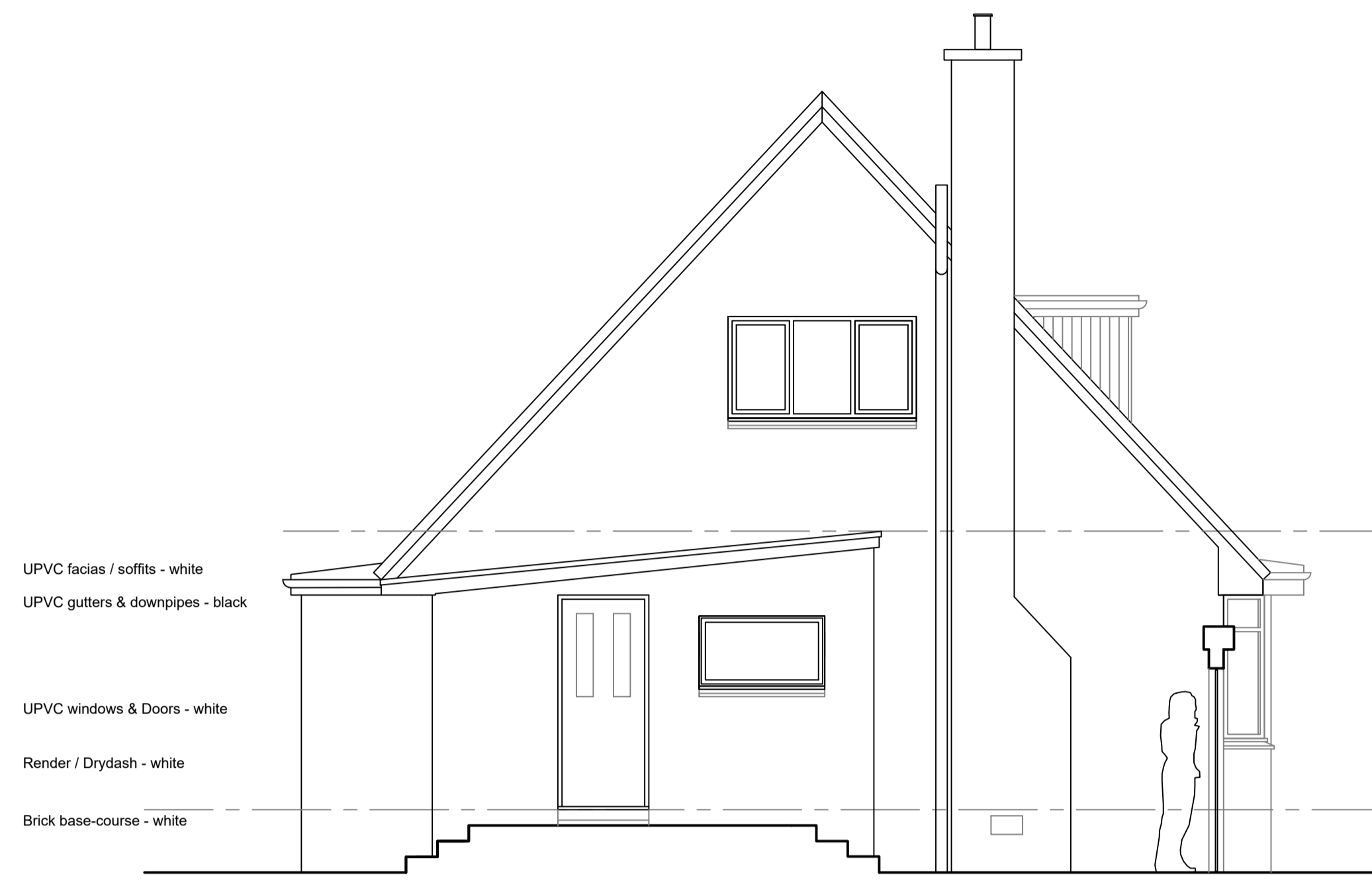
Side (North) Elevation as Existing 1:50

Notes: Contractor to check all dimensions on site before commencing works. Report any discrepancies and omissions to Maple Leaf Architecture Ltd. This drawing is copyright © registered, and no part is to be copied or reused without the express permission of the above named company. DESIGN: Unless otherwise stated, the contents of this drawing have been produced subject to detailed survey, investigation and to consultation with specialist consultants, Local Authority and other such Statutory Undertakers. Unauthorised alteration or deviation from the information or details contained within will negate any liability on the part of the designer and may breach Statutory Conditions & CDM Regulations which may consequently lead to prosecution.