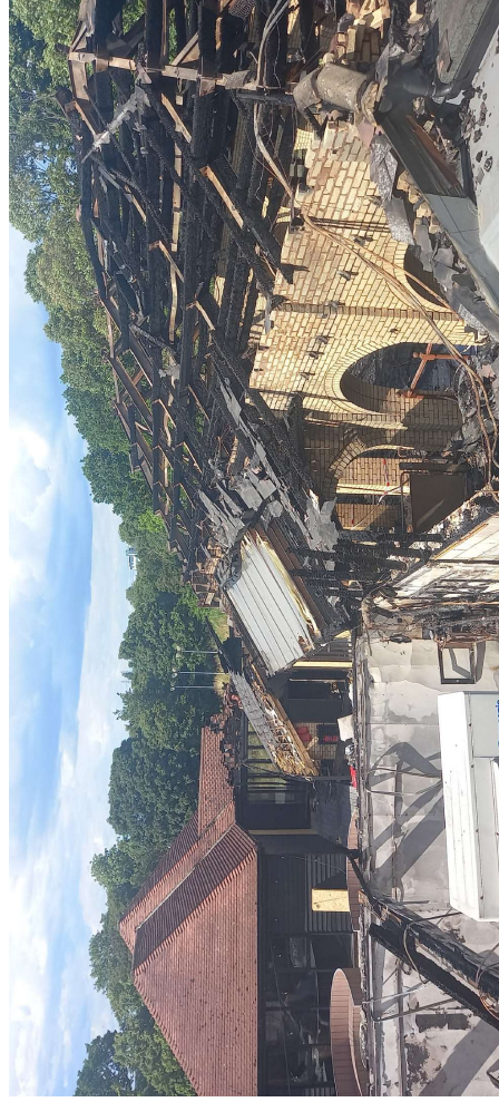
Pic 5 View from inside Studio space