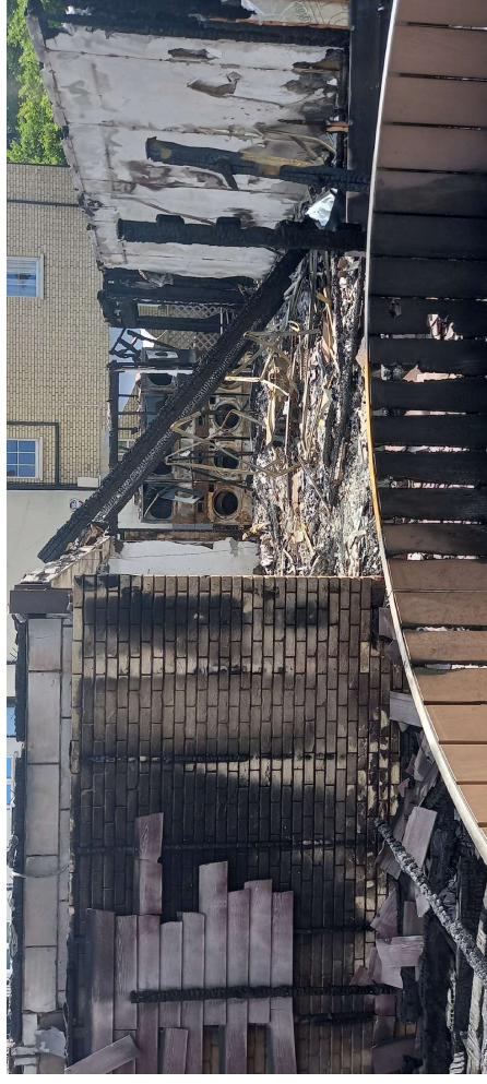
Pic 4 External relaxation terrace looking towards the studio and laundry