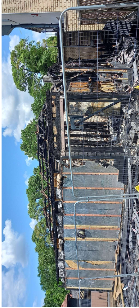
Pic 1 Shows view looking towards original laundry and studio