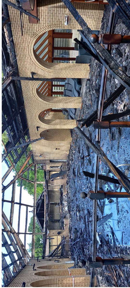
Pic 2 Pool hall looking towards spa