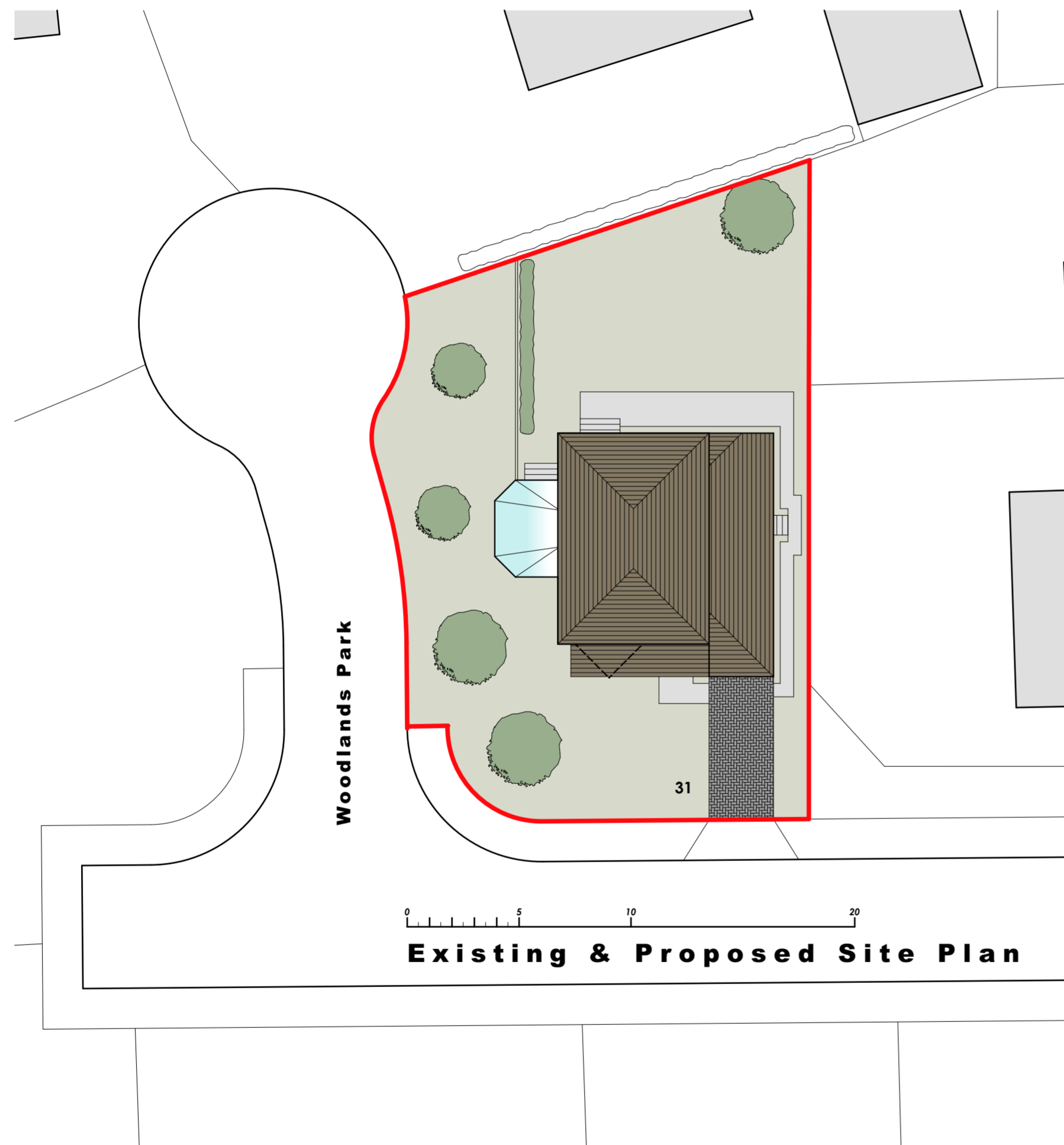
Existing & Proposed Site Plan