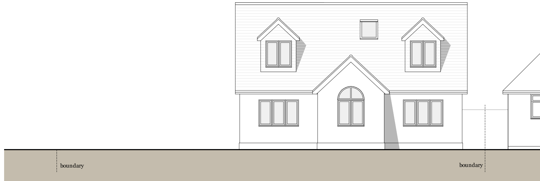
Front Elevation (North)