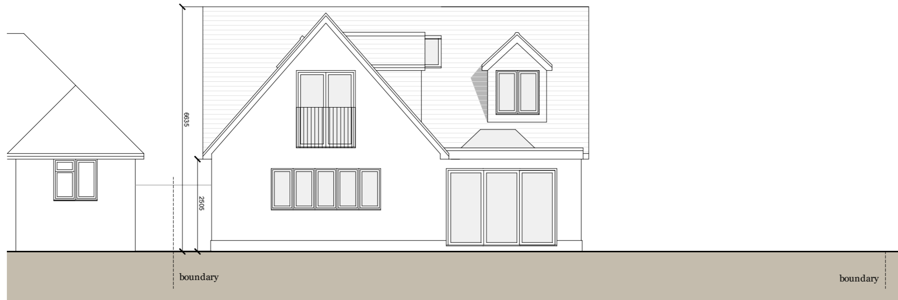
Rear Elevation (South)