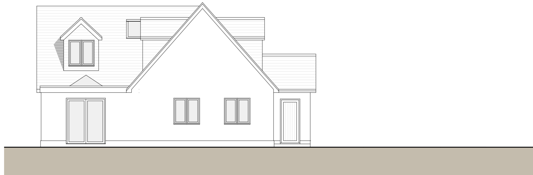
Side Elevation (East)