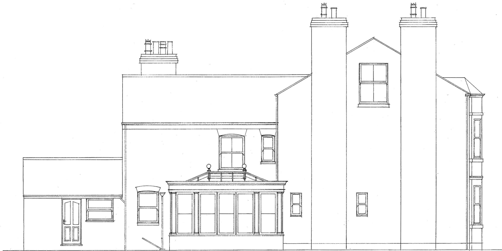
SOUTH WEST FACING ELEVATION