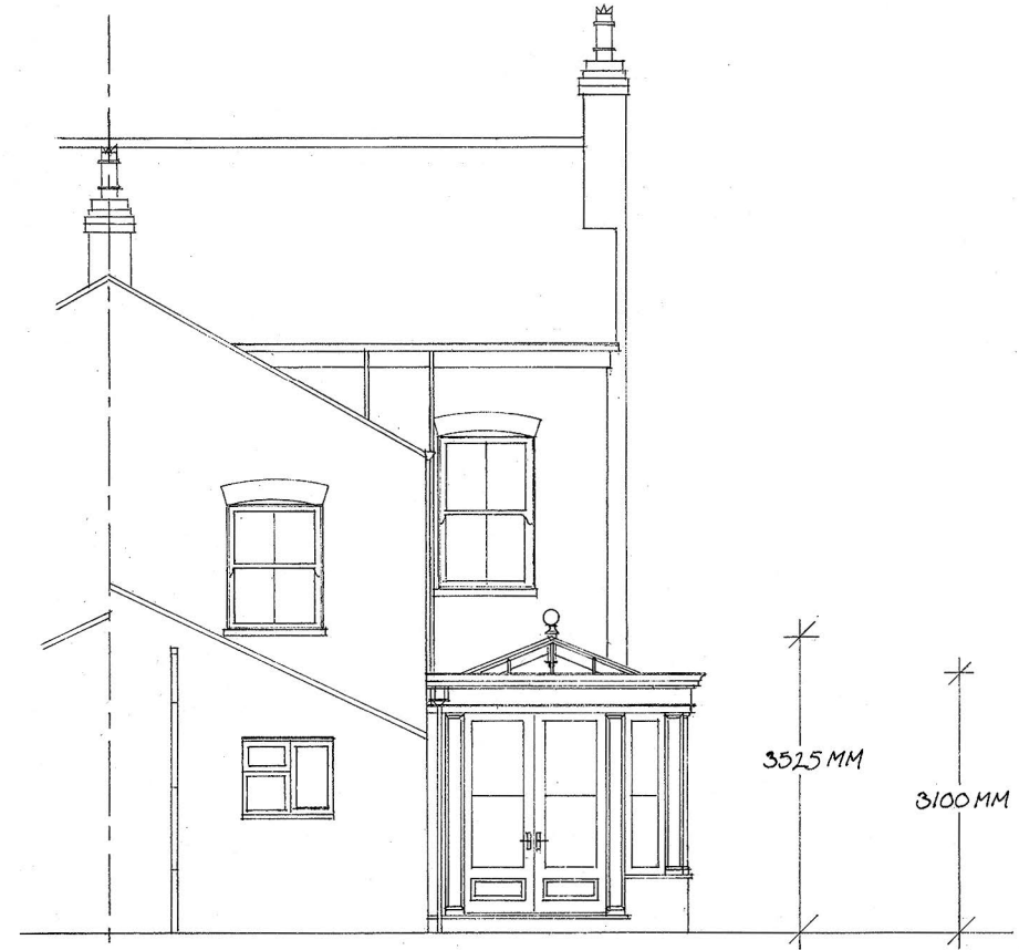
NORTH WEST FACING ELEVATION