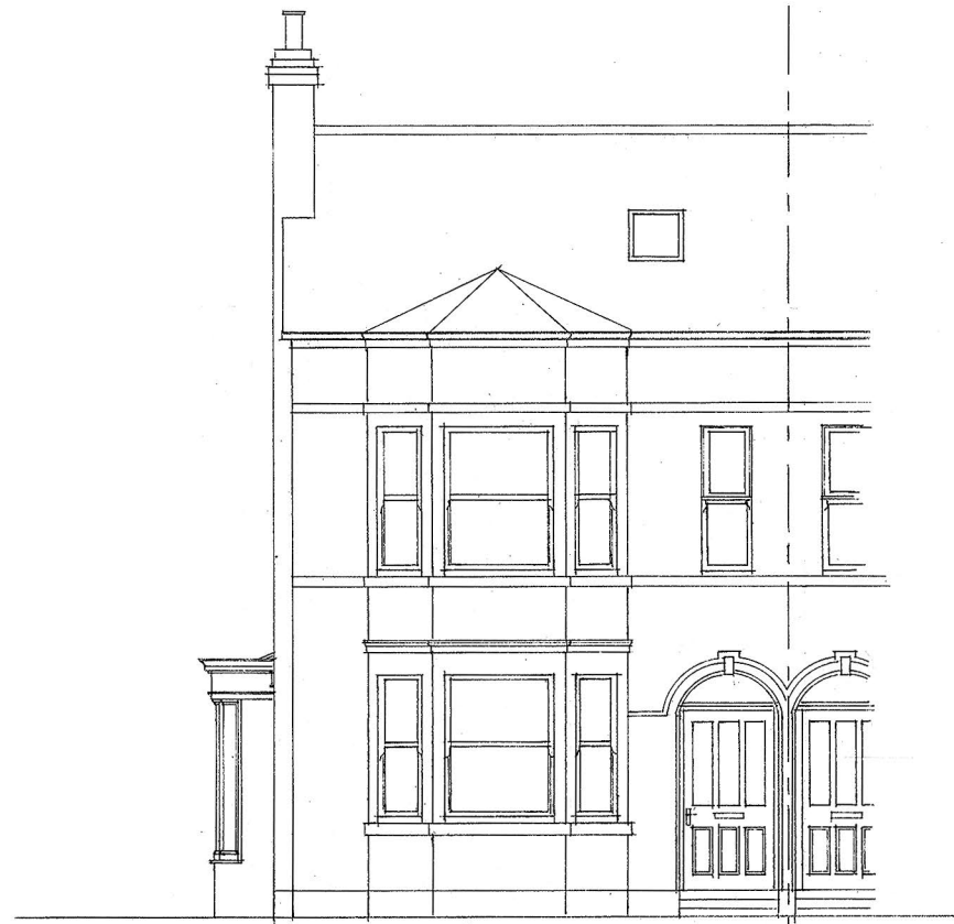
SOUTH EAST FACING ELEVATION