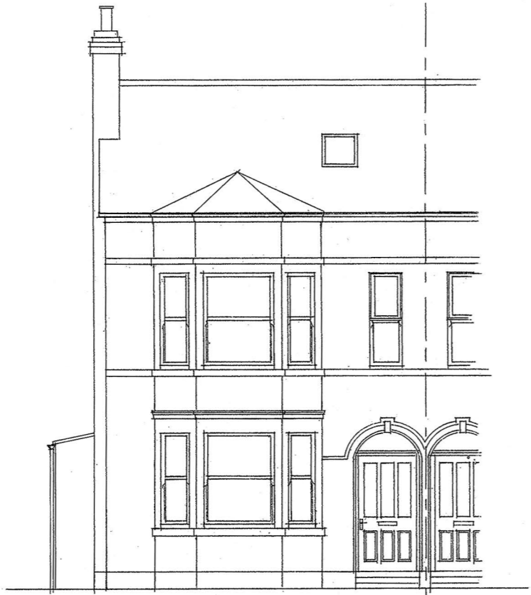
SOUTH EAST FACING ELEVATION