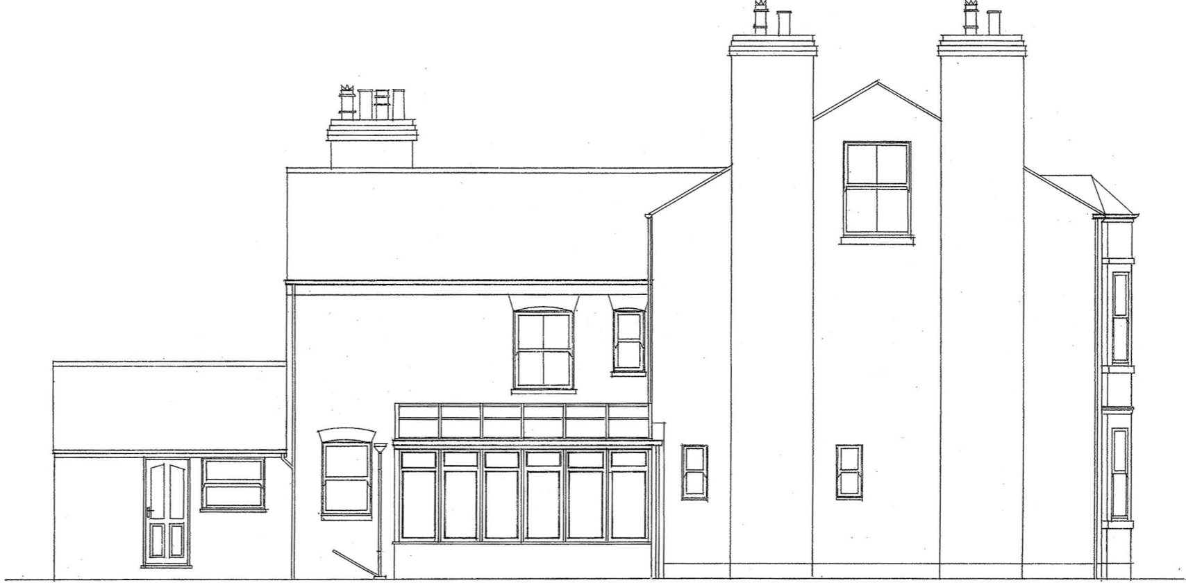
SOUTH WEST FACING ELEVATION