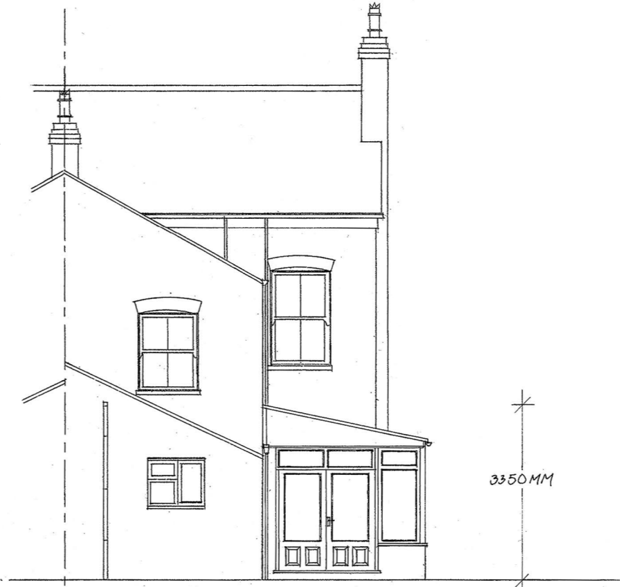
NORTH WEST FACING ELEVATION