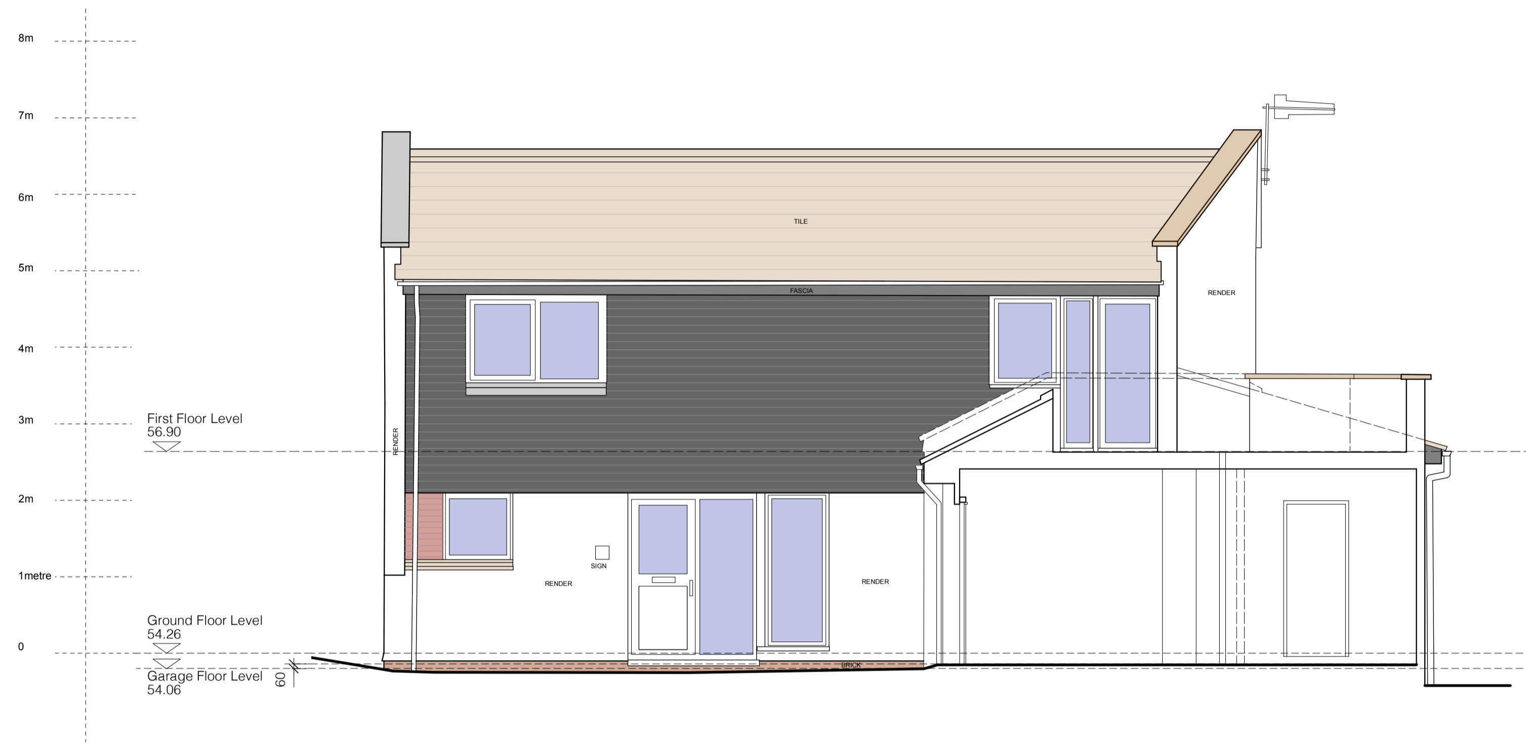
SECTION A - A

A 10/01/24 DG Updated in accordance with clients requirements Rev Date Initials Details