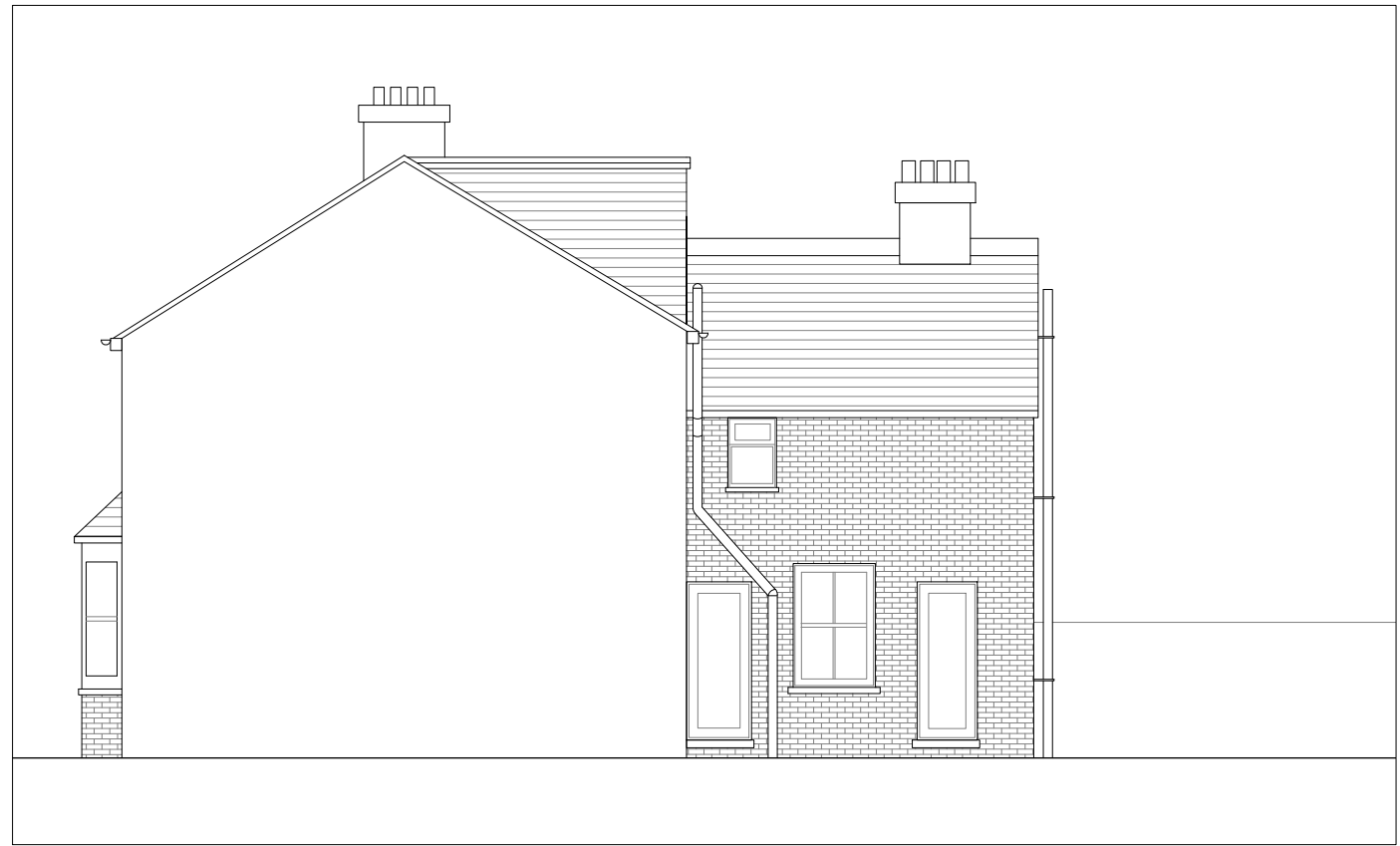
02 Existing North Elevation 1:100 @ A3