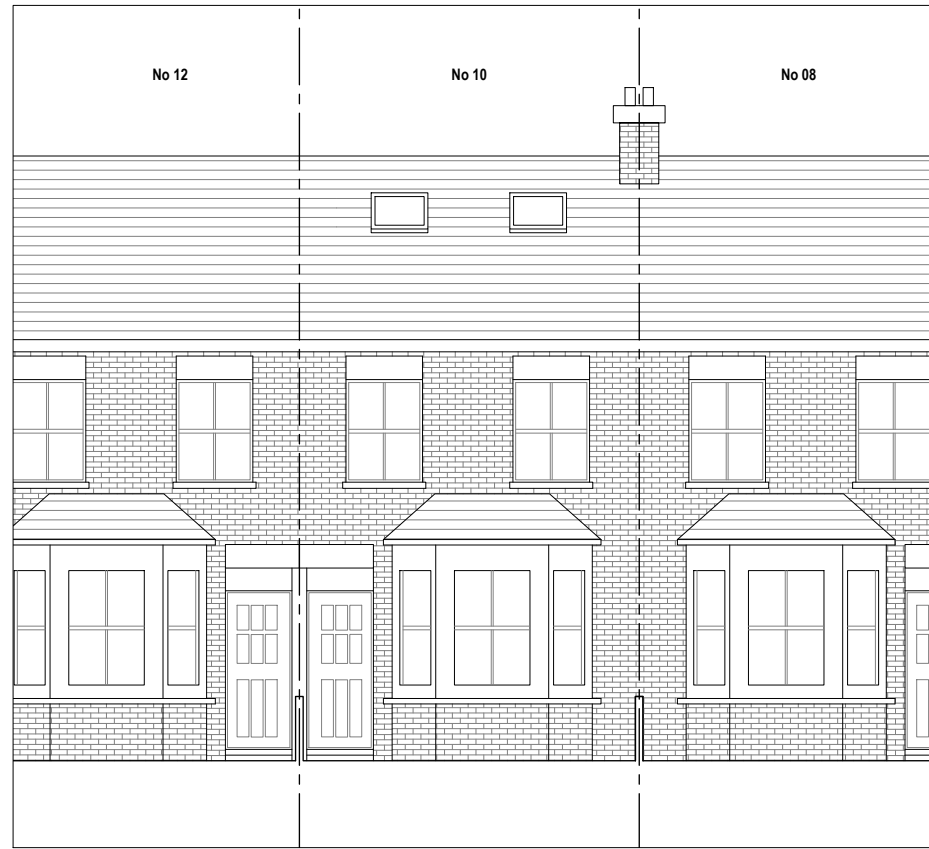
01 Existing Front Elevation 1:100 @ A3