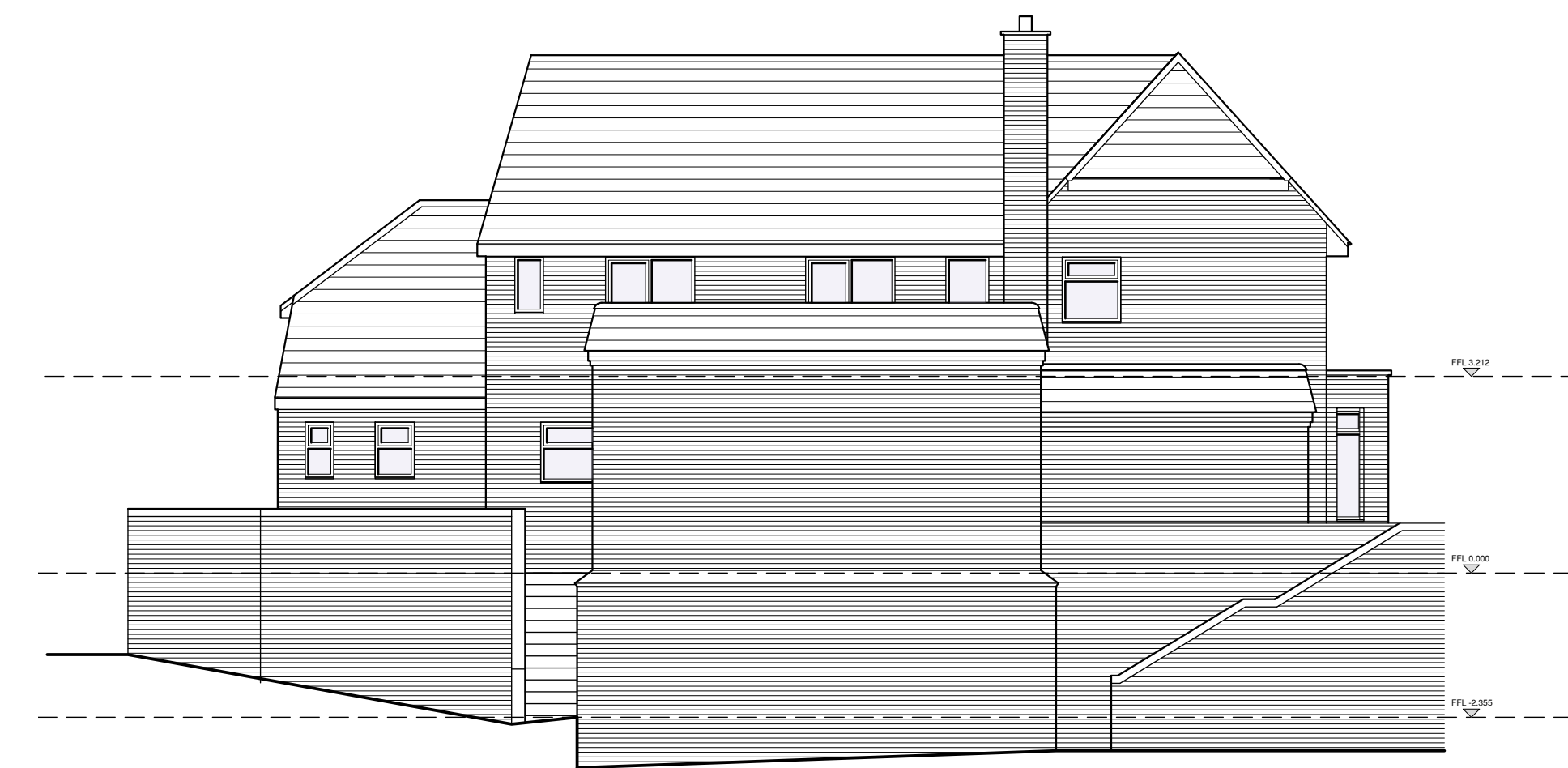
Existing North Elevation

Project The Markham Arms Dotsef Drive Birmingham Chesterfield S43 1DN