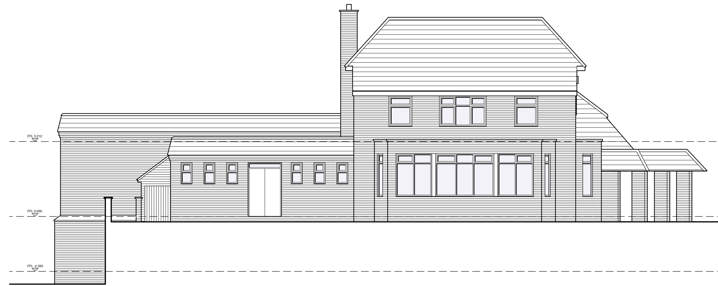
Existing West Elevation

Gutters & Fascias: Black UPVC downpipes.