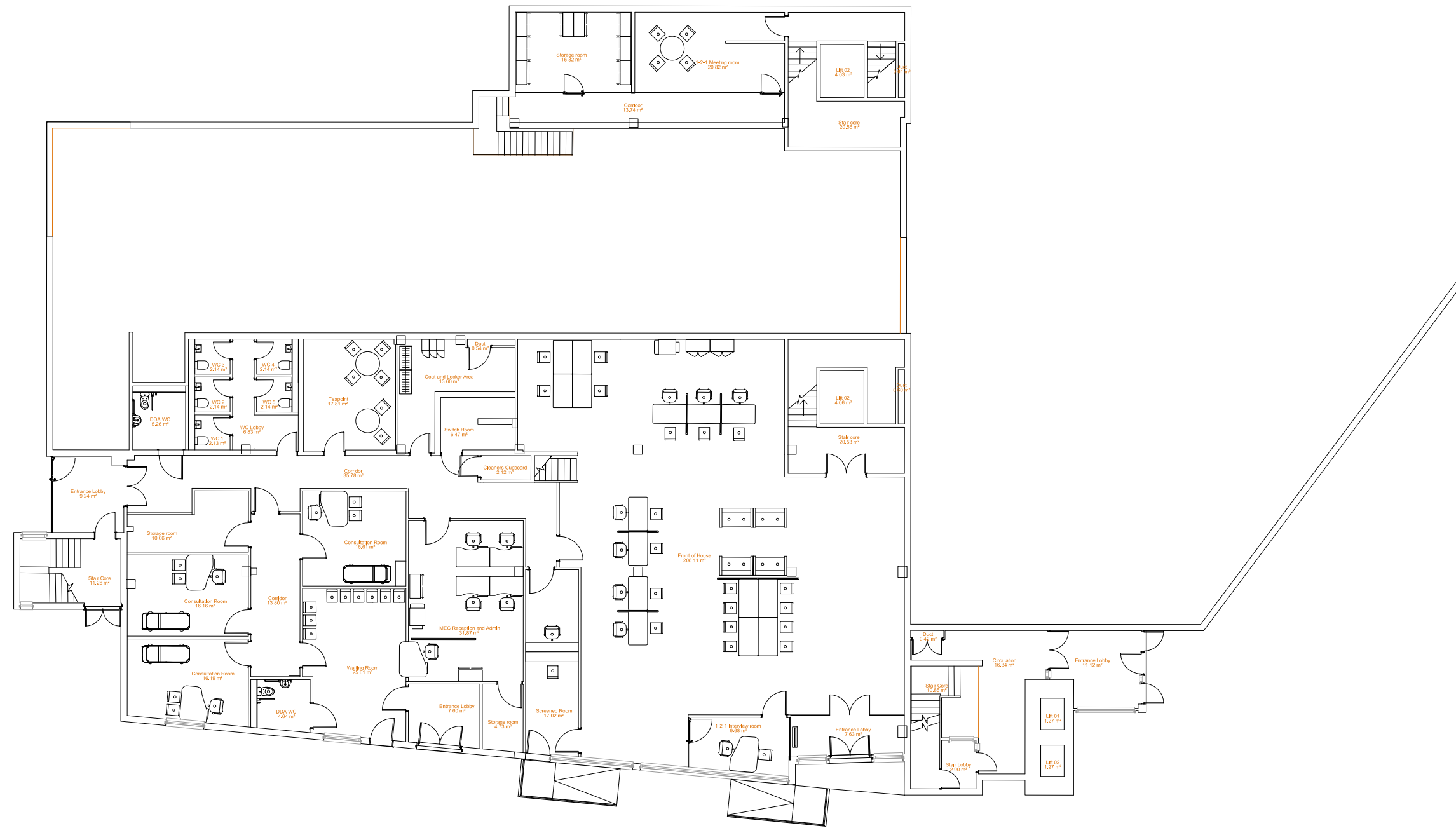
GROUND FLOOR PLAN SCALE @ 1:200