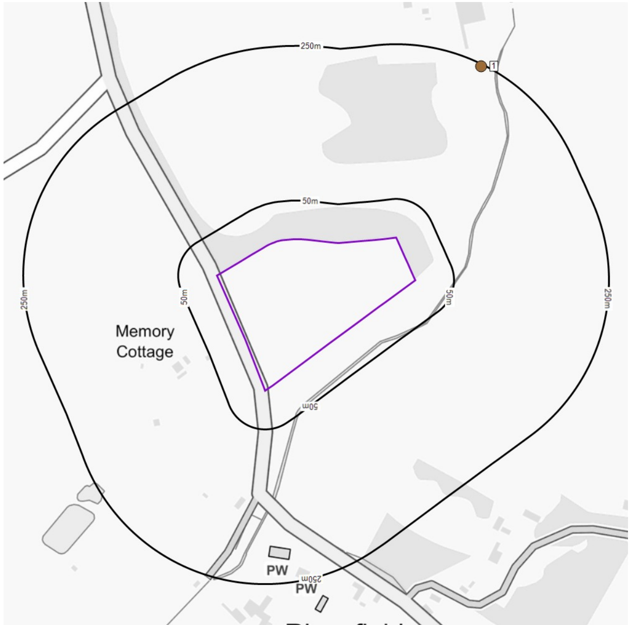
Contains Ordnance Survey data © Crown copyright and database right 2024.

The map below shows the location of potentially contaminative historical land uses that have been identified from historical maps and other sources. Further details are shown on the following pages.