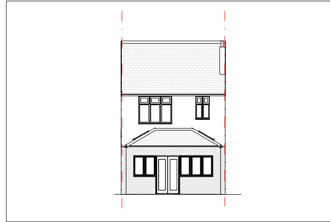
Existing Elevation - Rear