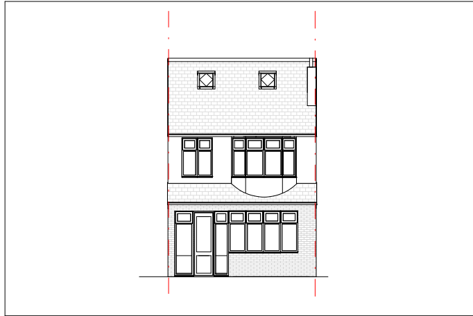
Existing Elevation - Front