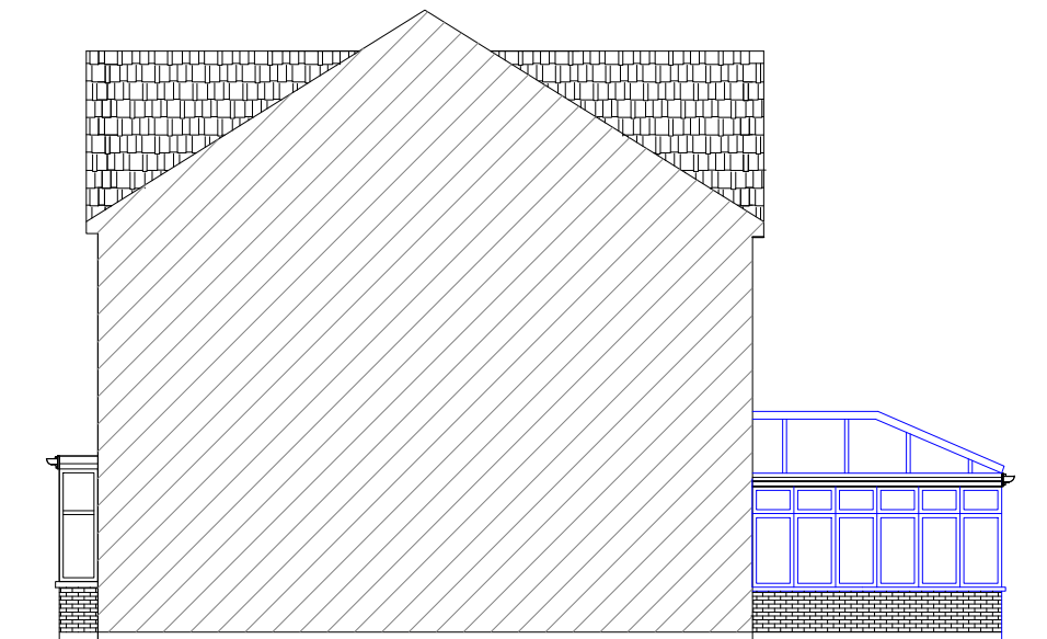
EXISTING SOUTH EAST ELEVATION