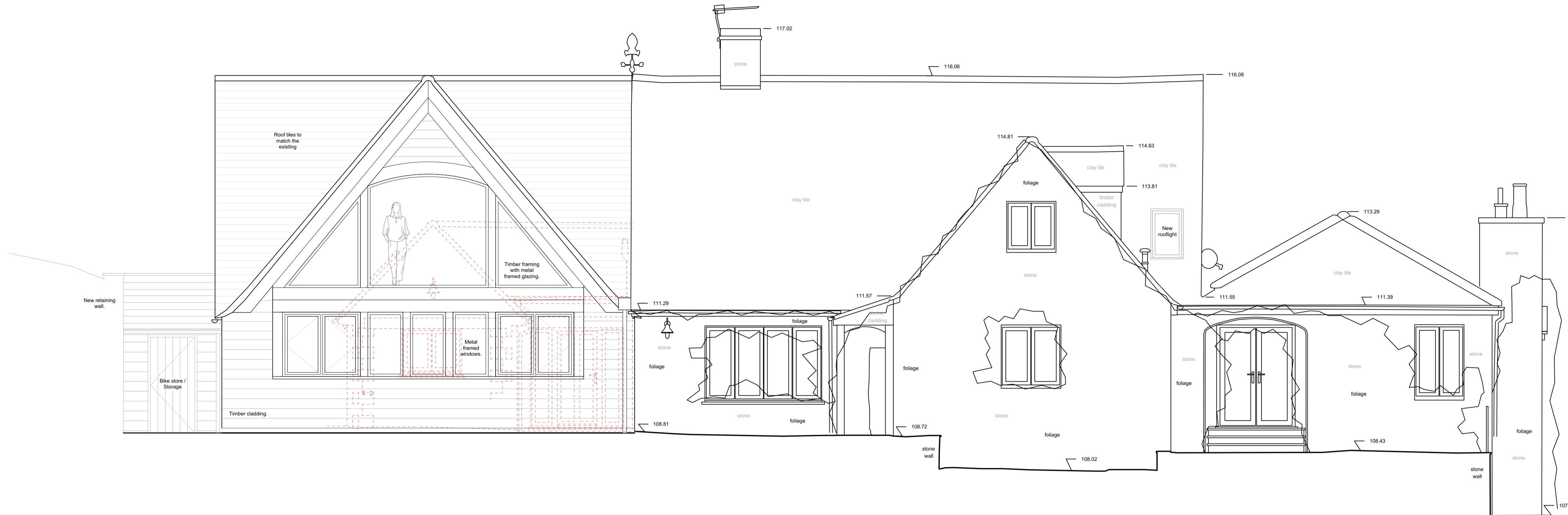
106.00m Datum Line WEST ELEVATION