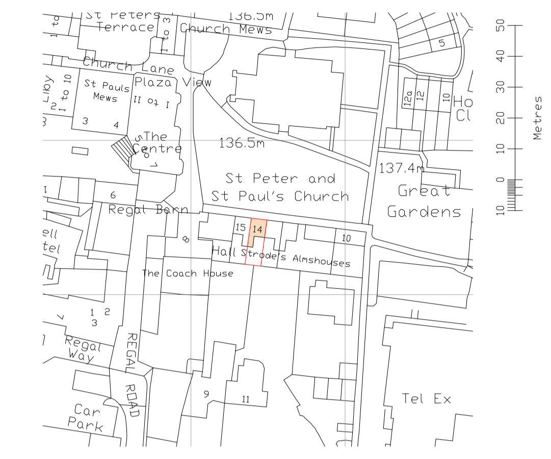
2 SITE PLAN