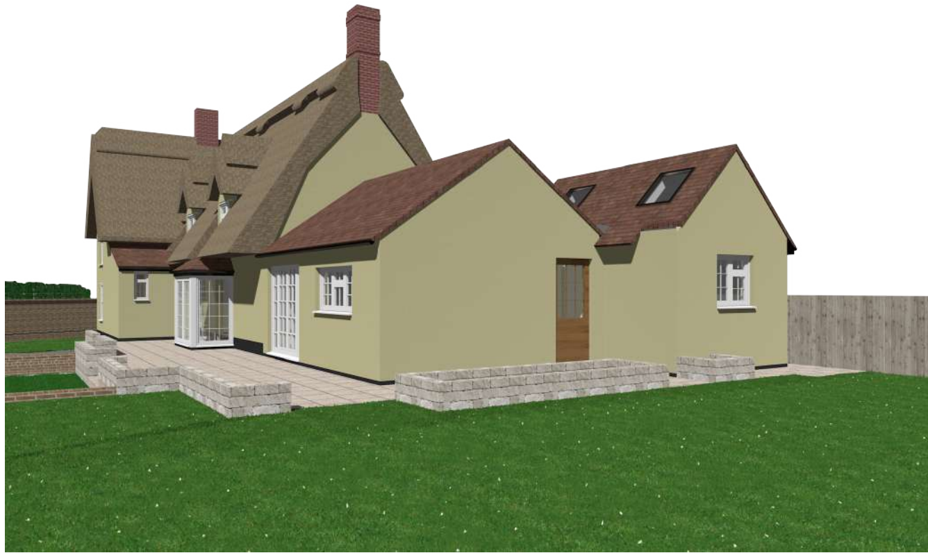
Existing Rear Side View