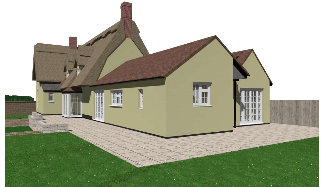
Proposed Rear Side View