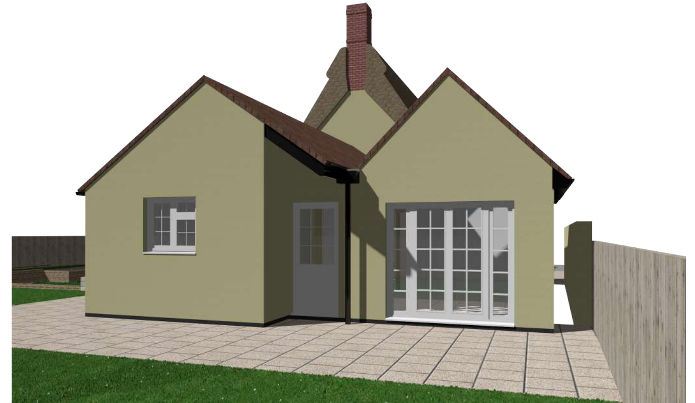
Proposed Rear View