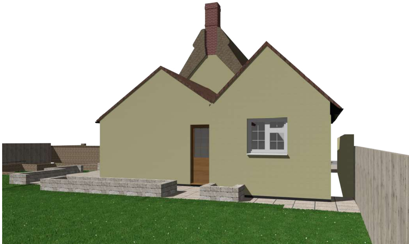
Existing Rear View