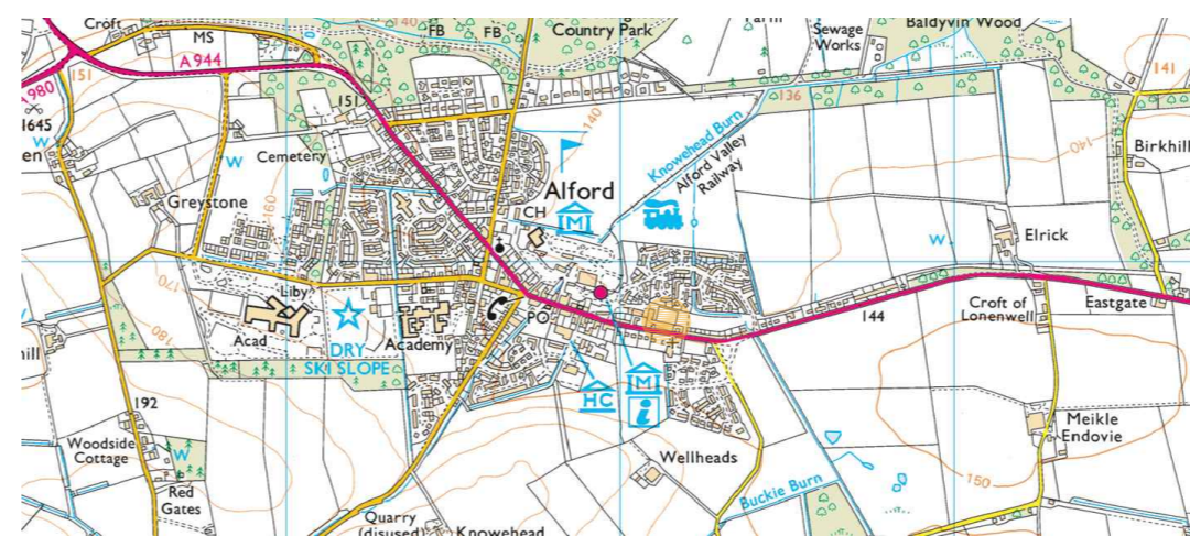
OS Map Scale 1:25,000