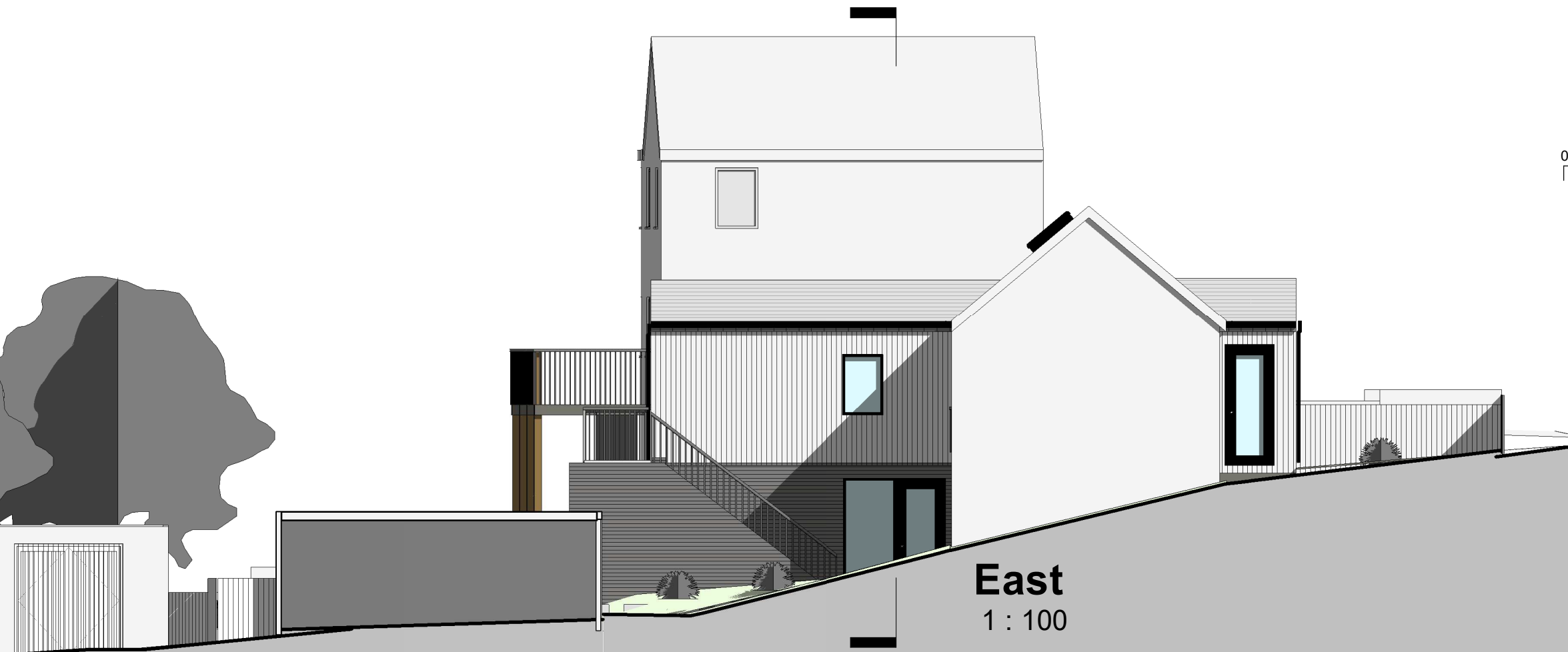
East 1 : 100

CRK Architecture PERSONALISED DESIGN & MANAGEMENT SERVICES