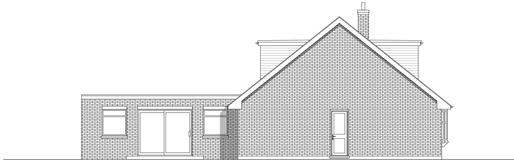
1 FLANK ELEVATION EAST ELEVATION SCALE 1:100