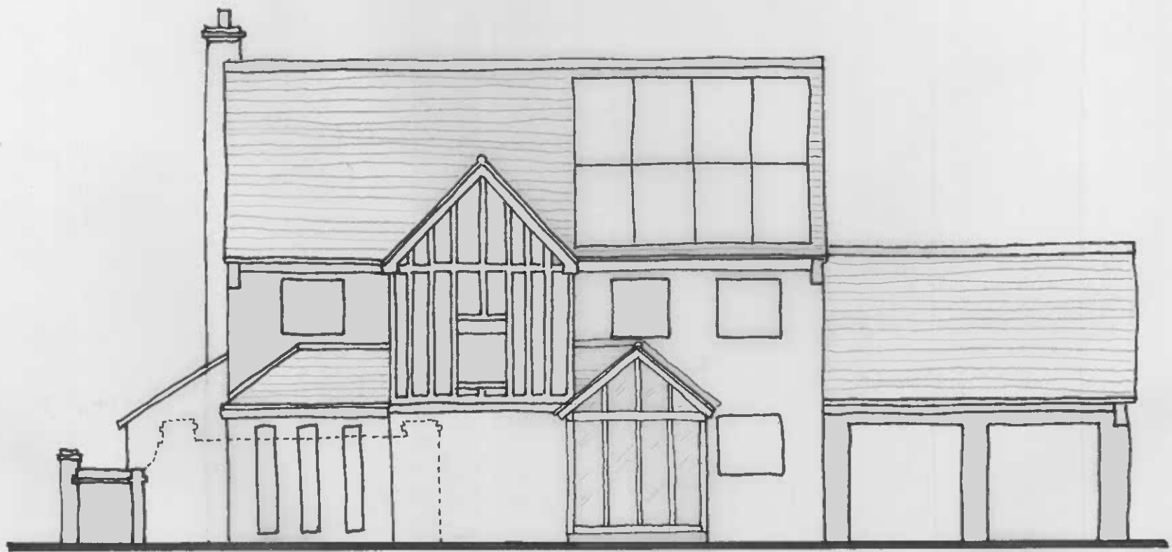
FRONT PORCH PROPOSED NORTH WEST ELEVATION

MR & MRS WAKELING, 1 BUNYAN CLOSE, GAMLINGAY - PROPOSED GARDEN ROOM & FRONT PORCH.