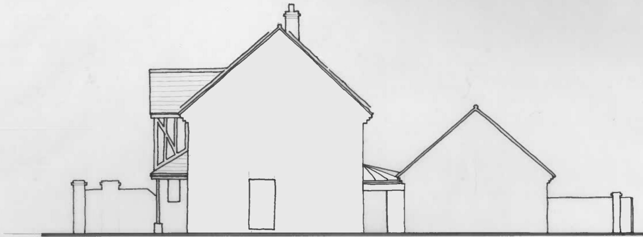
EXISTING SOUTH WEST ELEVATION