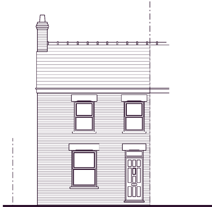
Front Elevation to High Street