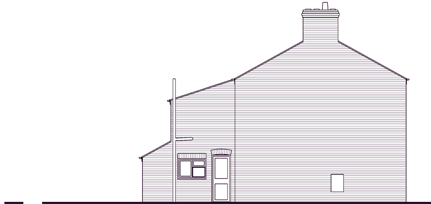
Side (North) Elevation