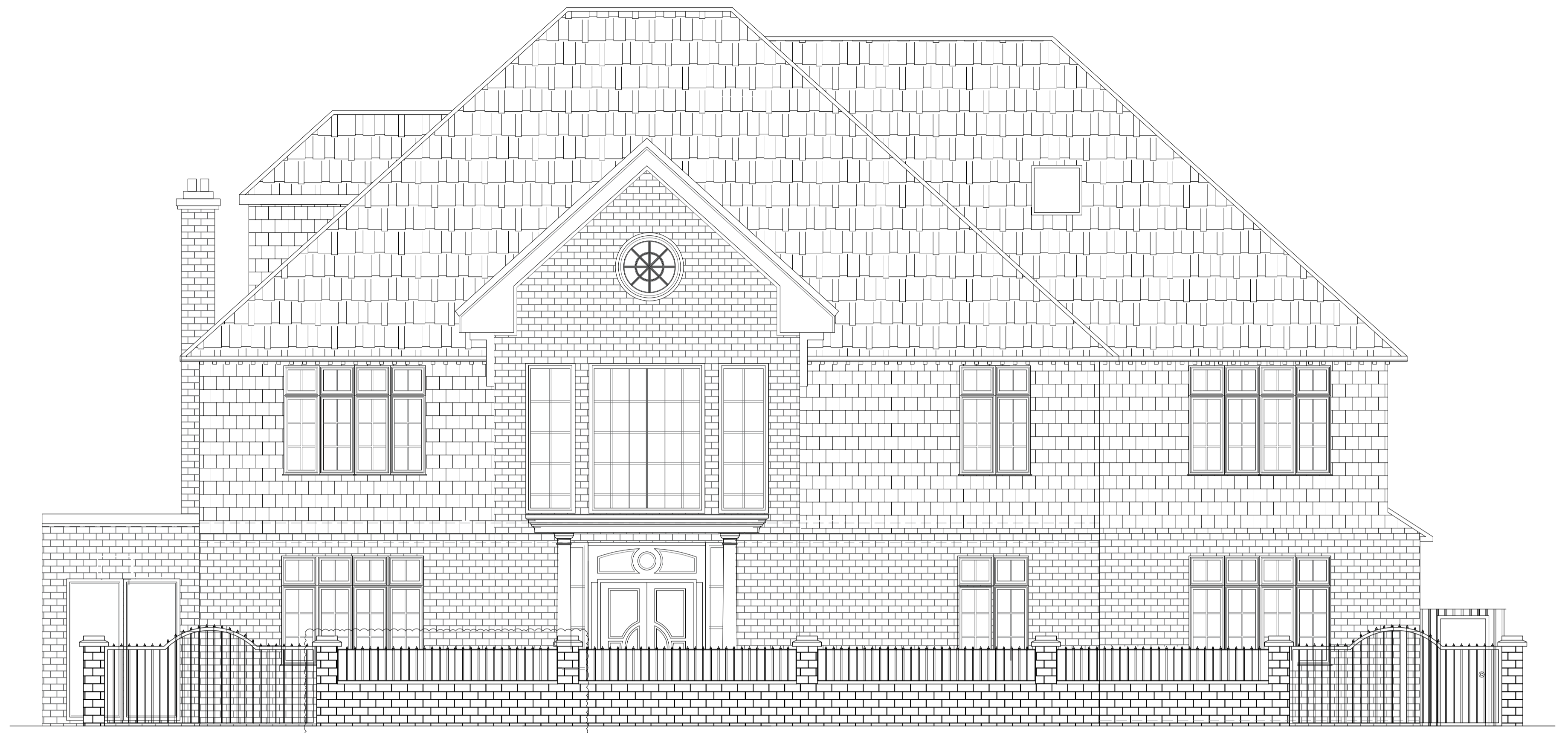
PROPOSED STREET VIEW ELEVATION SCALE 1:50