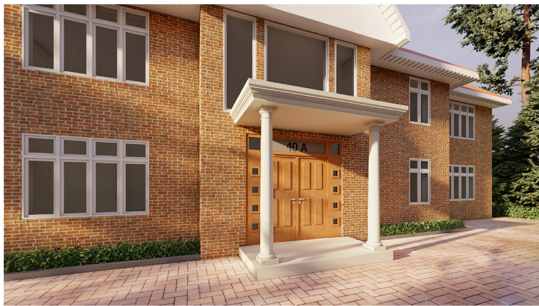
PROPOSED PORCH 3D VIEW