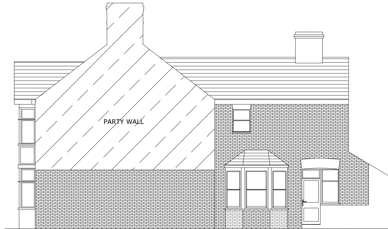
EXISTING SIDE ELEVATION - A