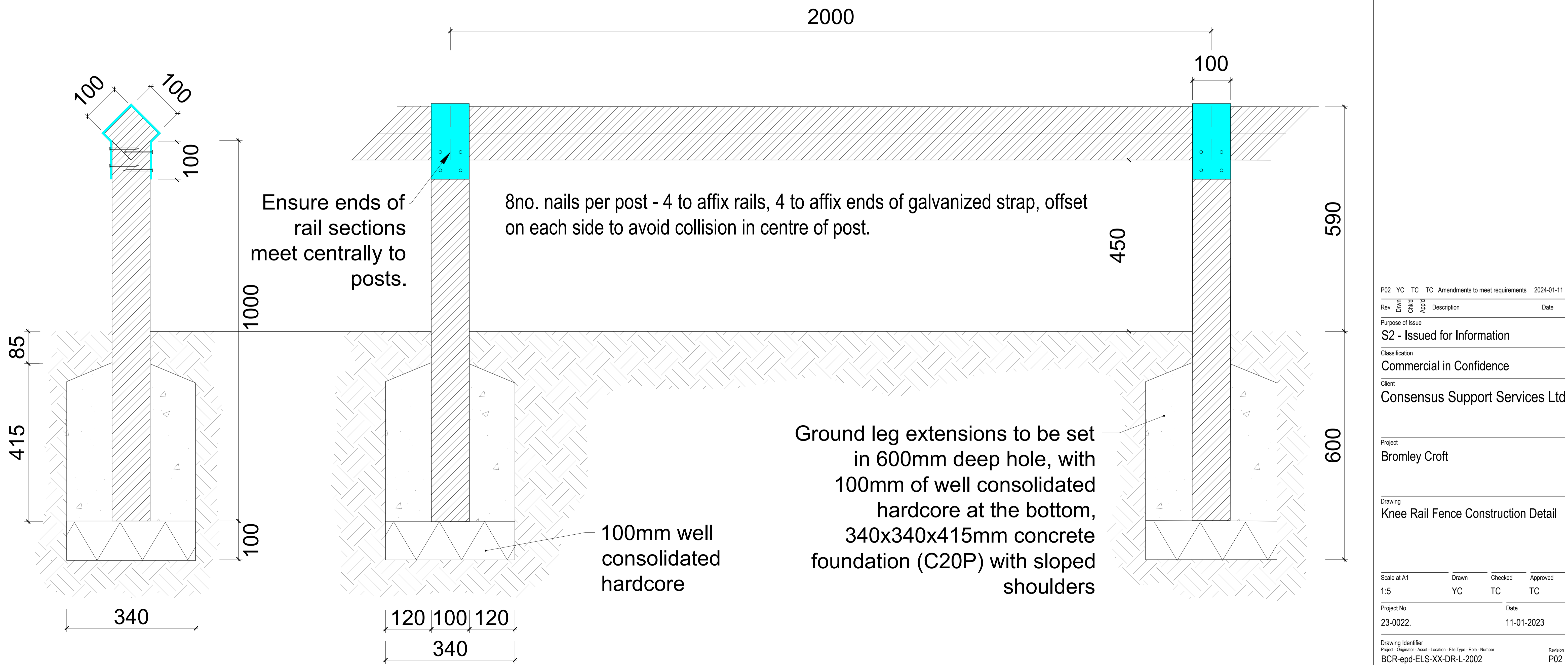
Timber knee rail side section 1:20@A4

Provide 2no. posts at sudden changes of direction and brace external corners with post set into the ground at 45 degrees.