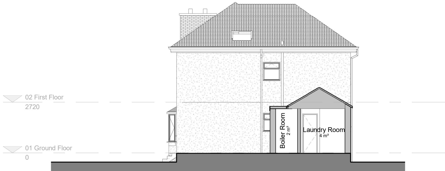
Section B-B Existing