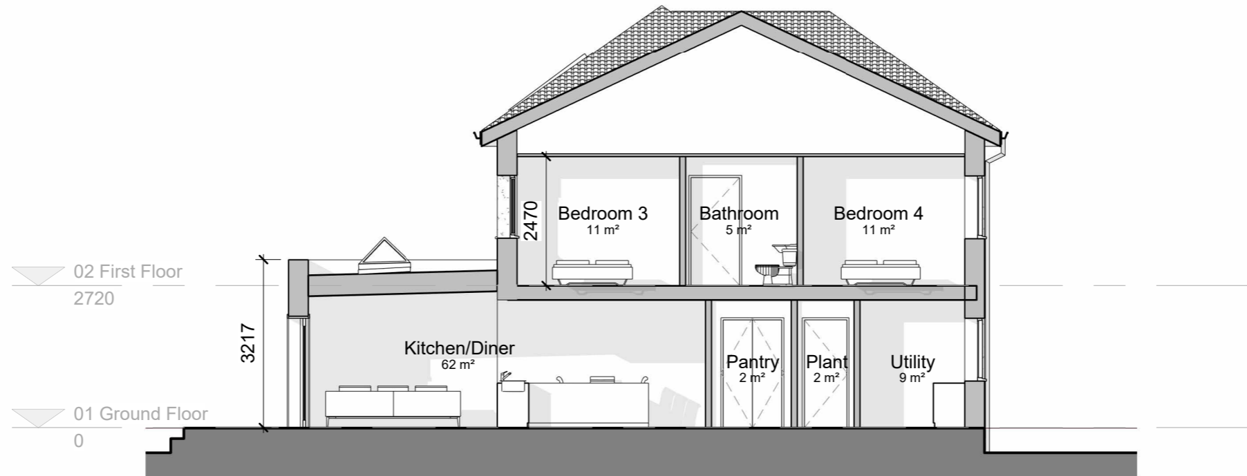
Section B-B Proposed