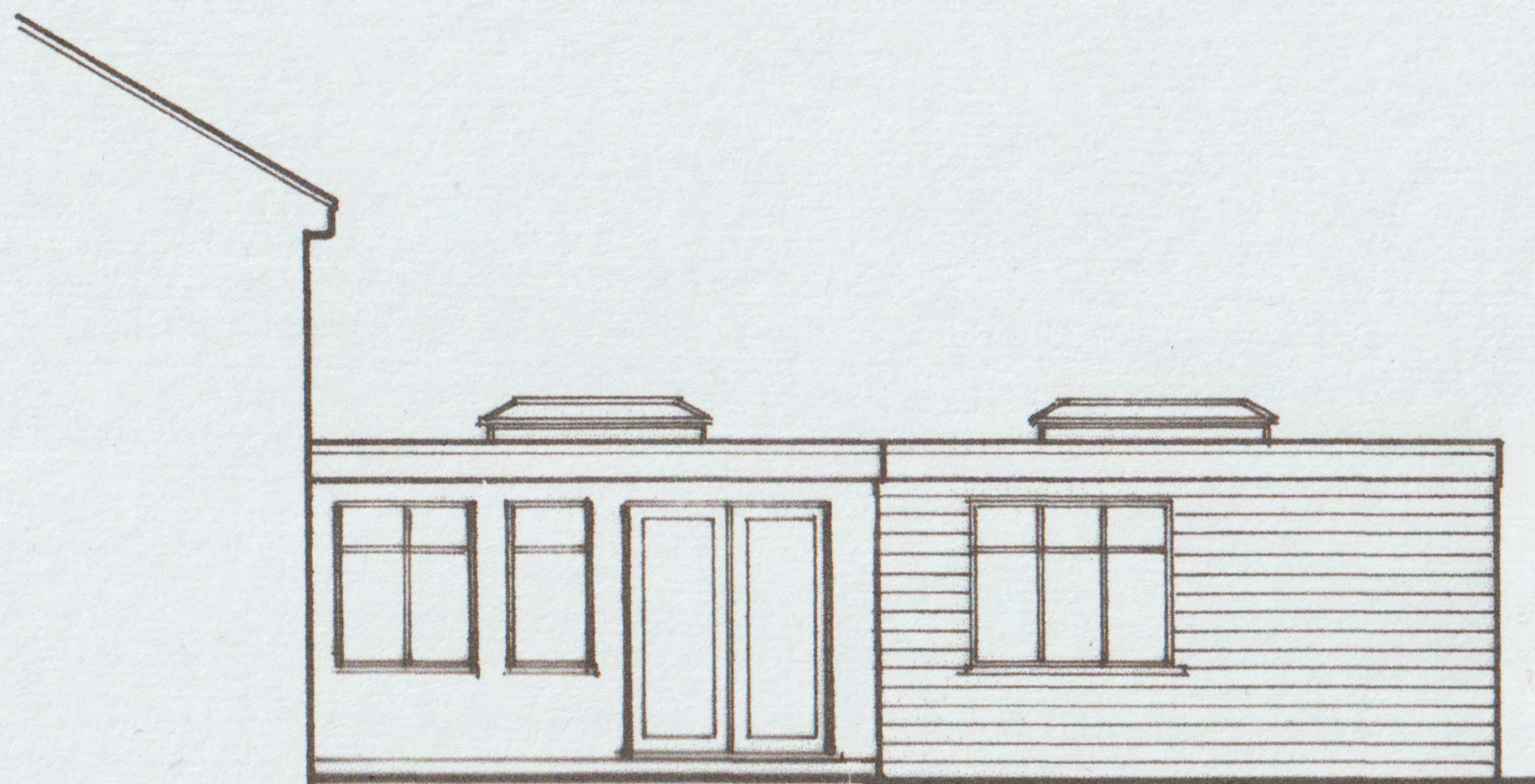
PROPOSED GARDEN SIDE ELEVATION