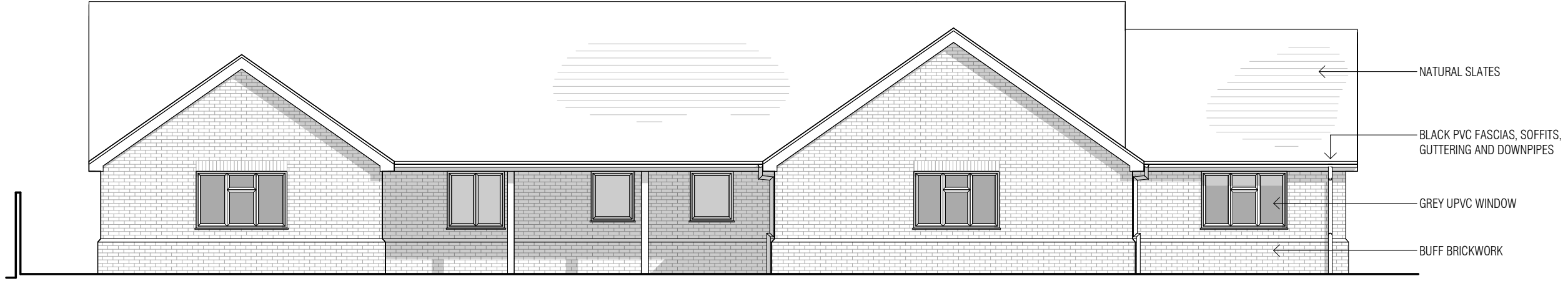
1 EXISTING WEST (FRONT) ELEVATION 1 : 100

WALL KEY ■ EXISTING WALLS SHOWN GREY ▨ PROPOSED WALLS SHOWN HATCHED