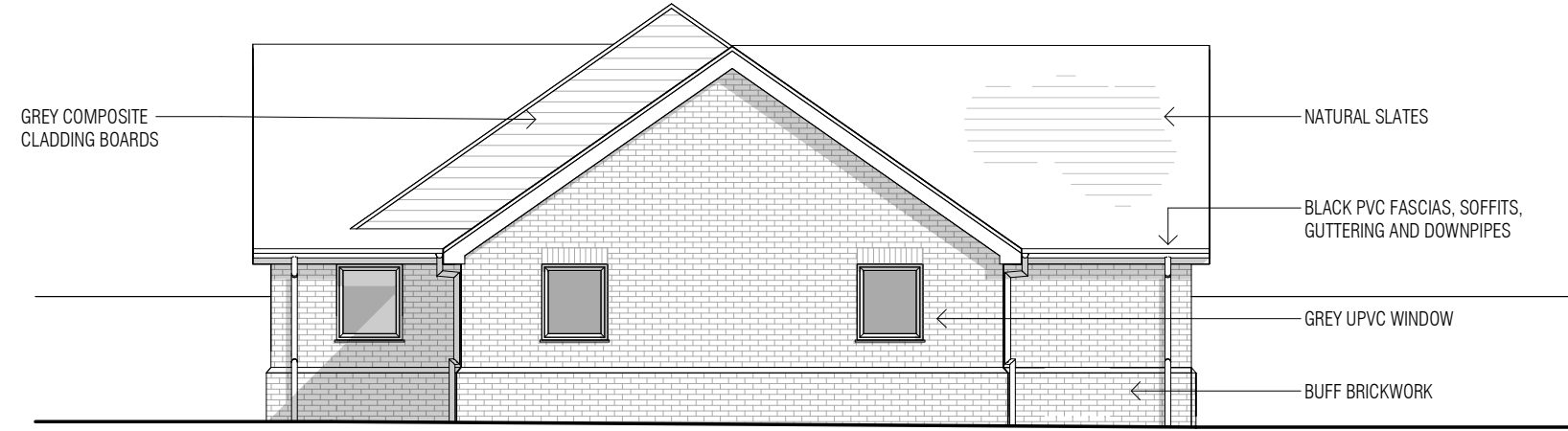
1 EXISTING NORTH ELEVATION 1 : 100

WALL KEY ■ EXISTING WALLS SHOWN GREY ▨ PROPOSED WALLS SHOWN HATCHED