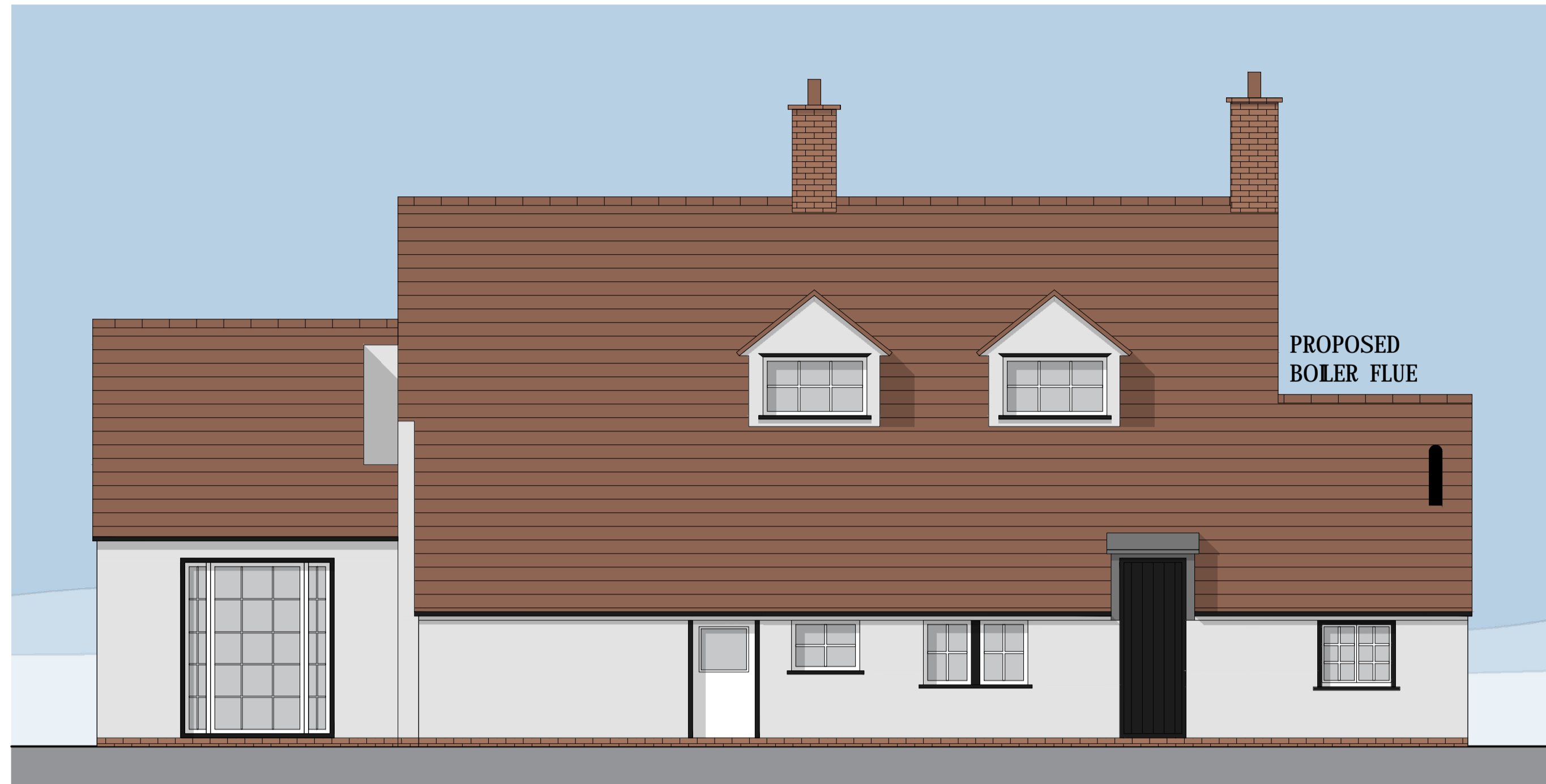
PROPOSED REAR ELEVATION (East) SCALE 1:50