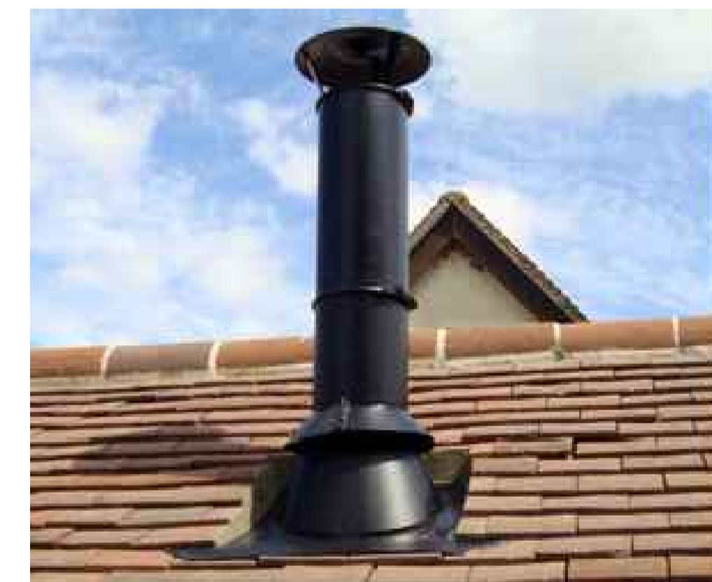
PROPOSED BOILER FLUE