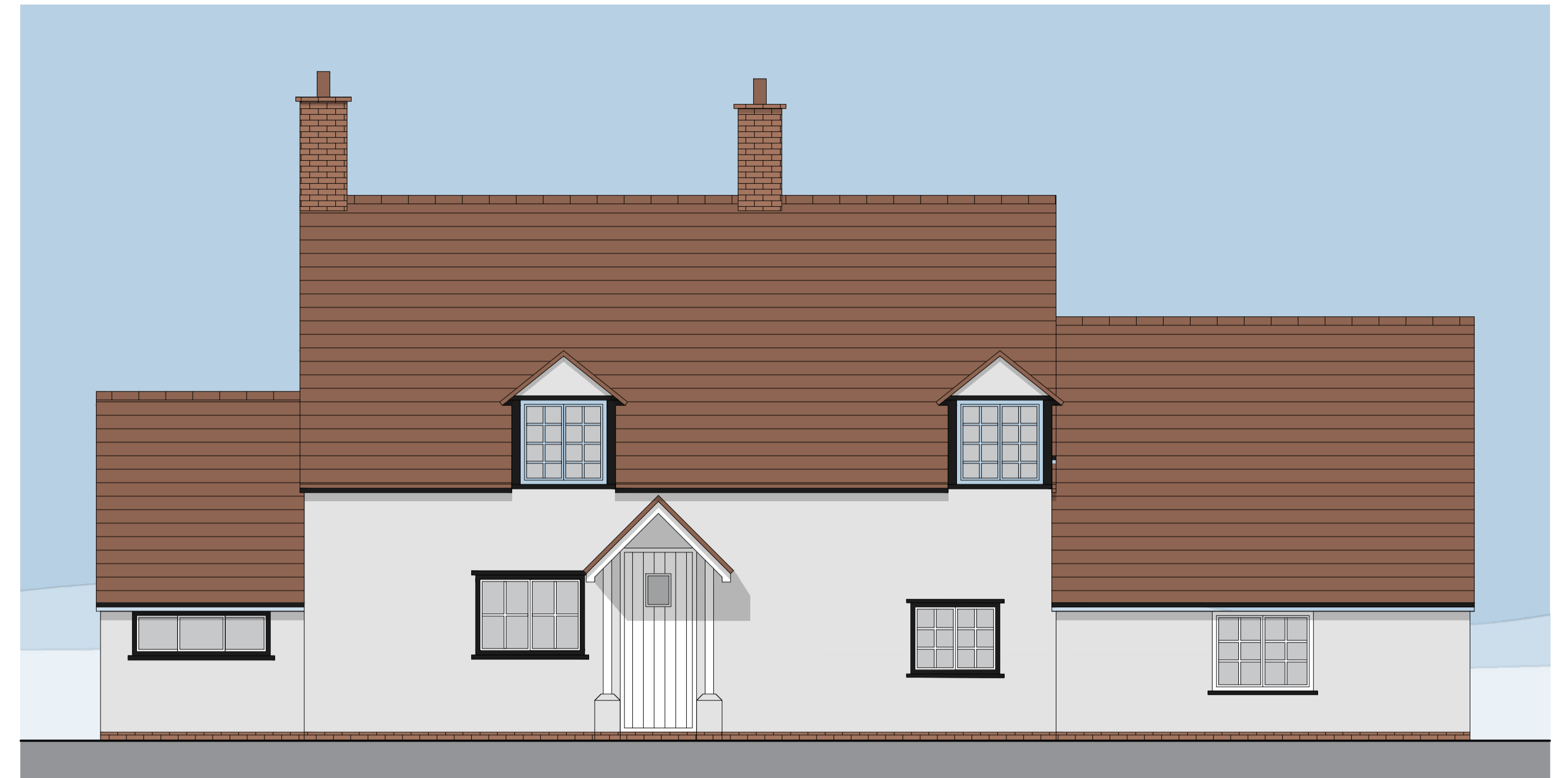
PROPOSED FRONT ELEVATION (West) SCALE 1:50