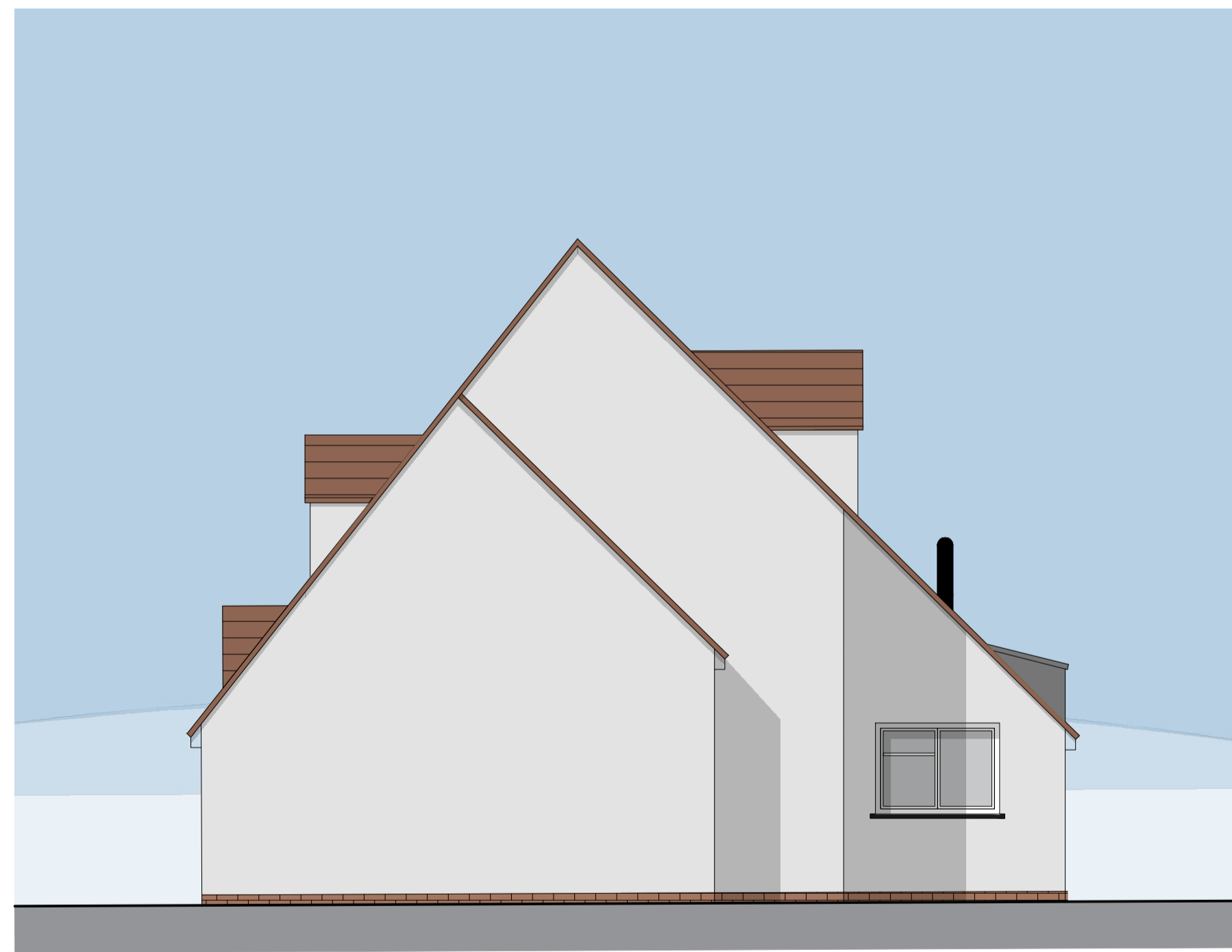
PROPOSED SIDE ELEVATION (South) SCALE 1:50