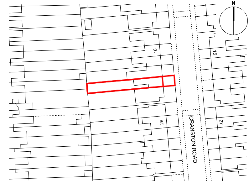
LOCATION MAP scale: 1:1250