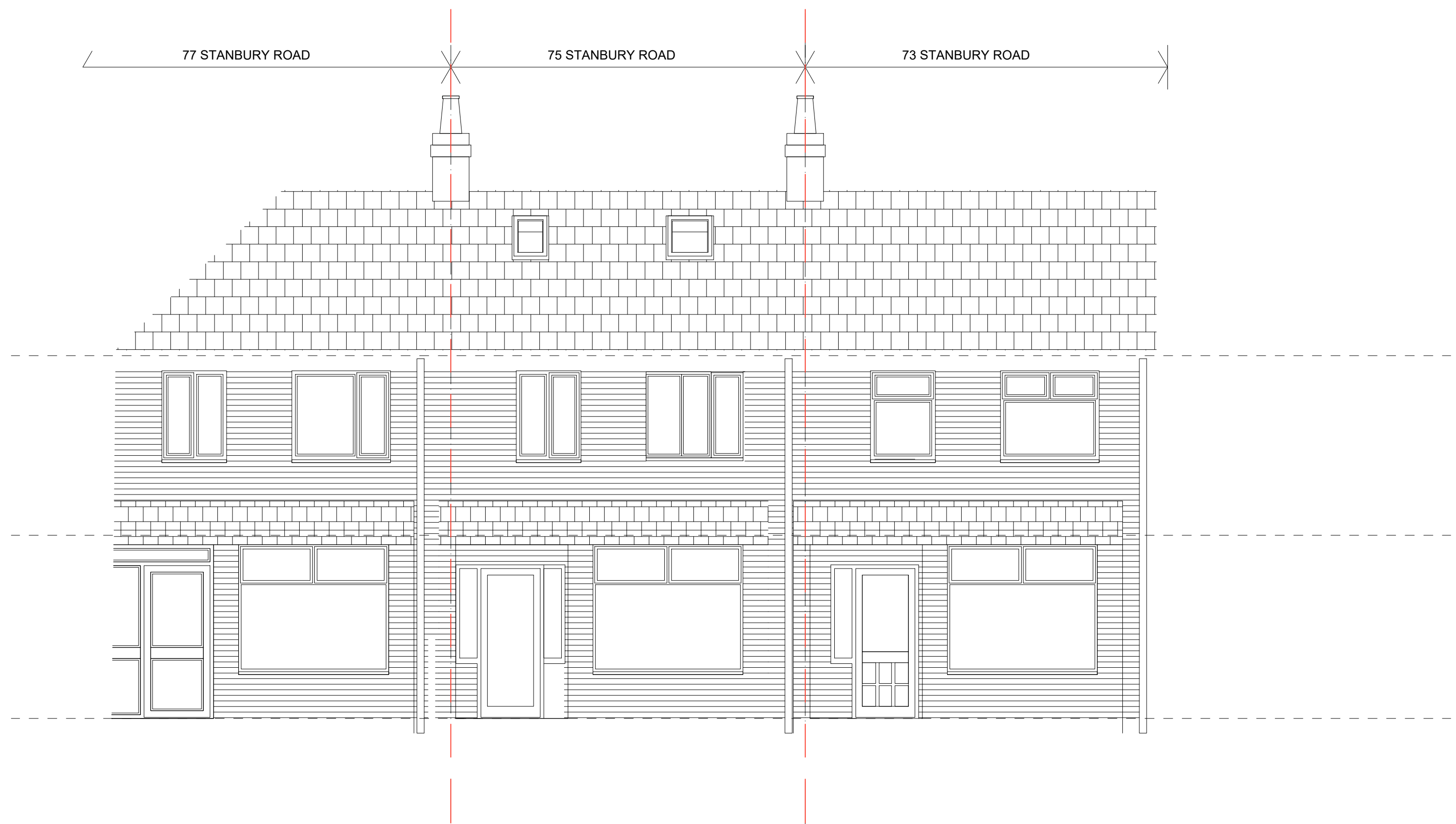
01 - EXISTING FRONT ELEVATION