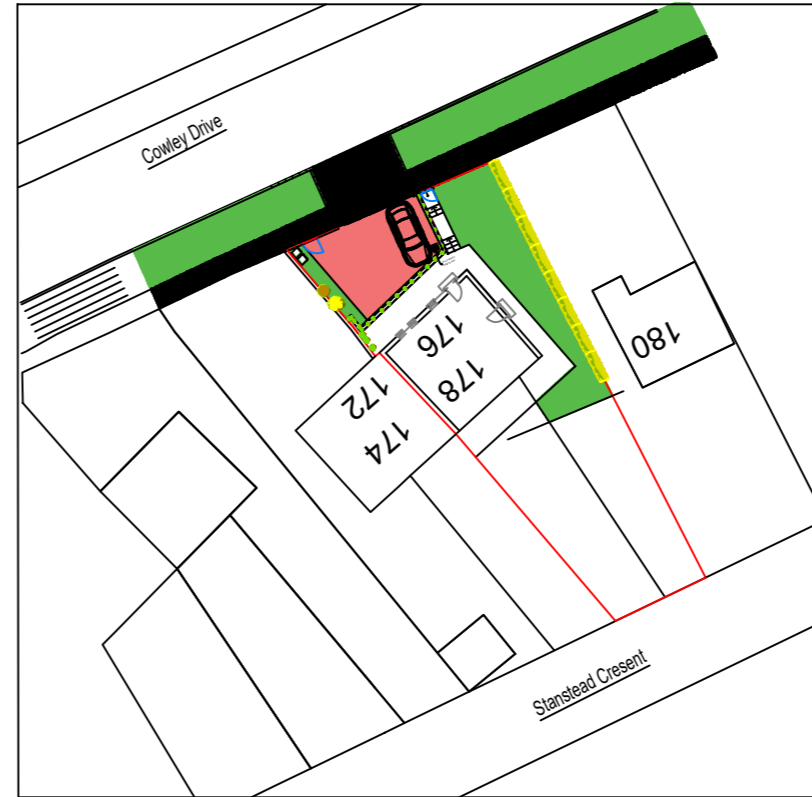
Proposed Site Plan.