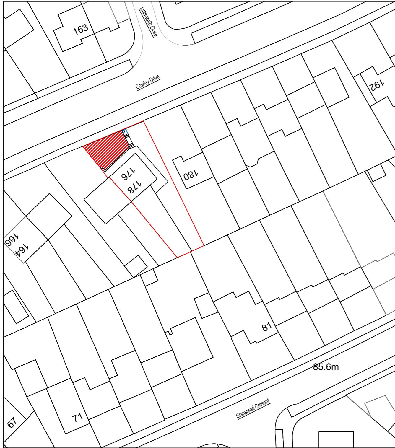
Existing Site Plan.