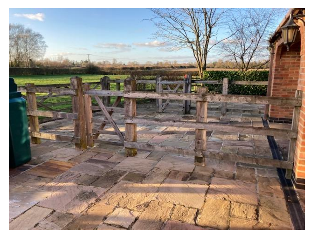
16. South west side inner timber fences and paved areas.