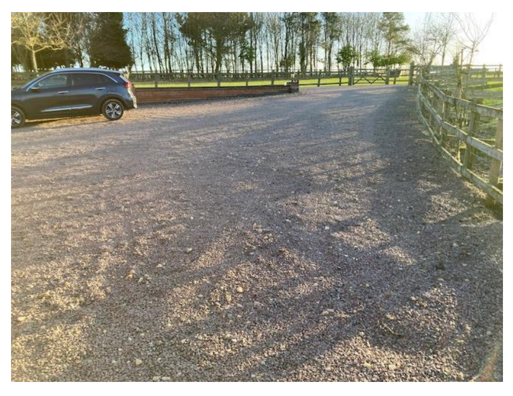
18. Front south west entrance and gravel turning and parking areas.