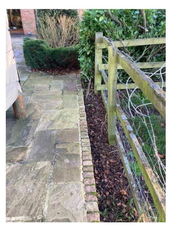
12. Rear south west side paving edge and timber fence to the grass paddock.