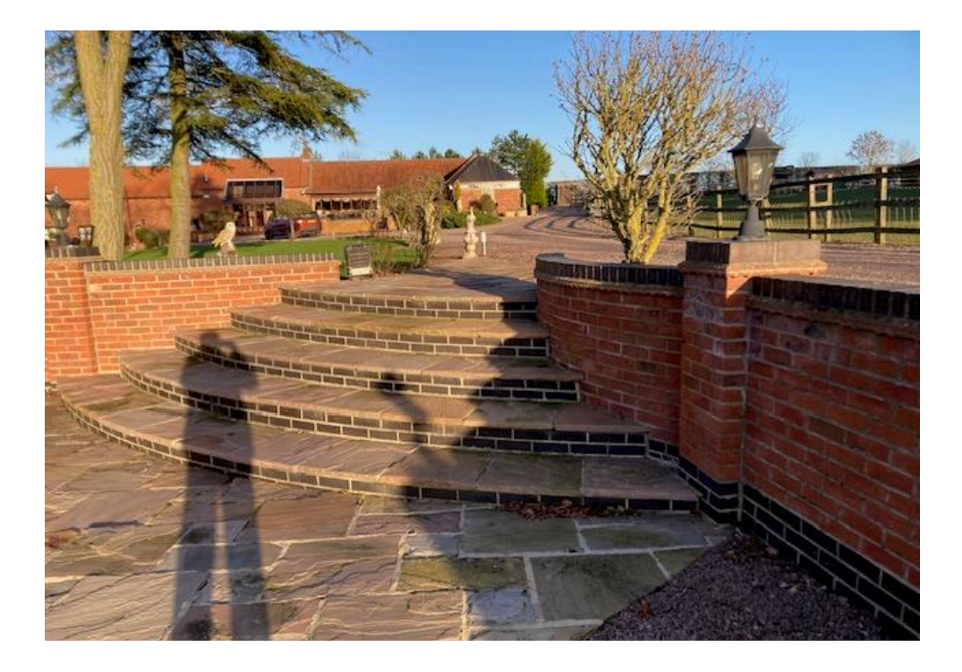
4. Steps at the front south east corner between brick boundary walls.