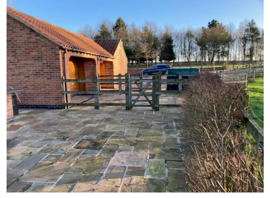
15. Paved areas, hedge and fence along the south west side of the Grange.