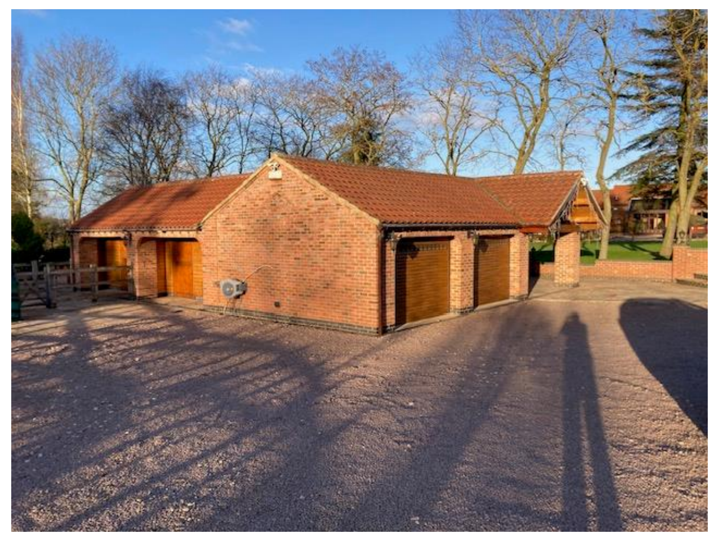
1. The front south corner of Car Hill Grange – front stone chipping surfaced car turning and parking area.

PHOTOGRAPHS CAR HILL GRANGE CAR LANE CAR COLSTON NOTTINGHAM NG13 8QU