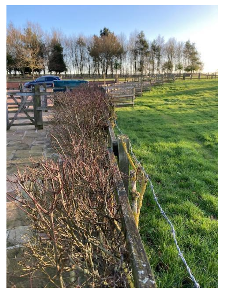
14. The rear south west hedge and timber fence to the grass paddock.