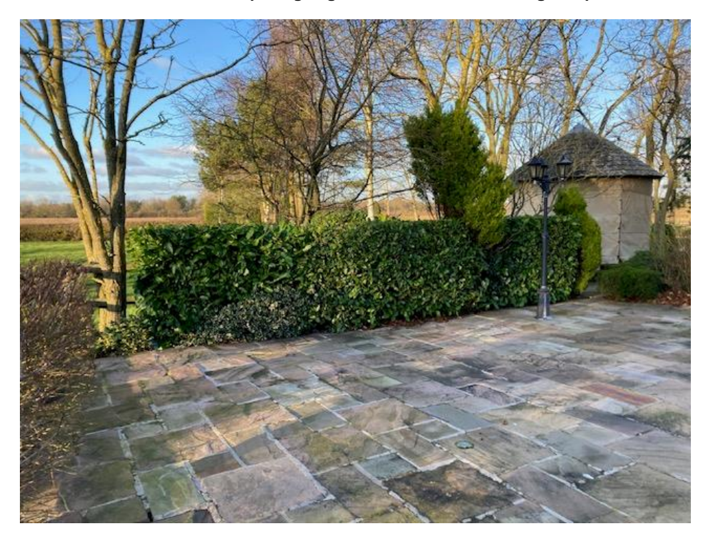
13. The north west rear paved patio and rear Laurel hedge.