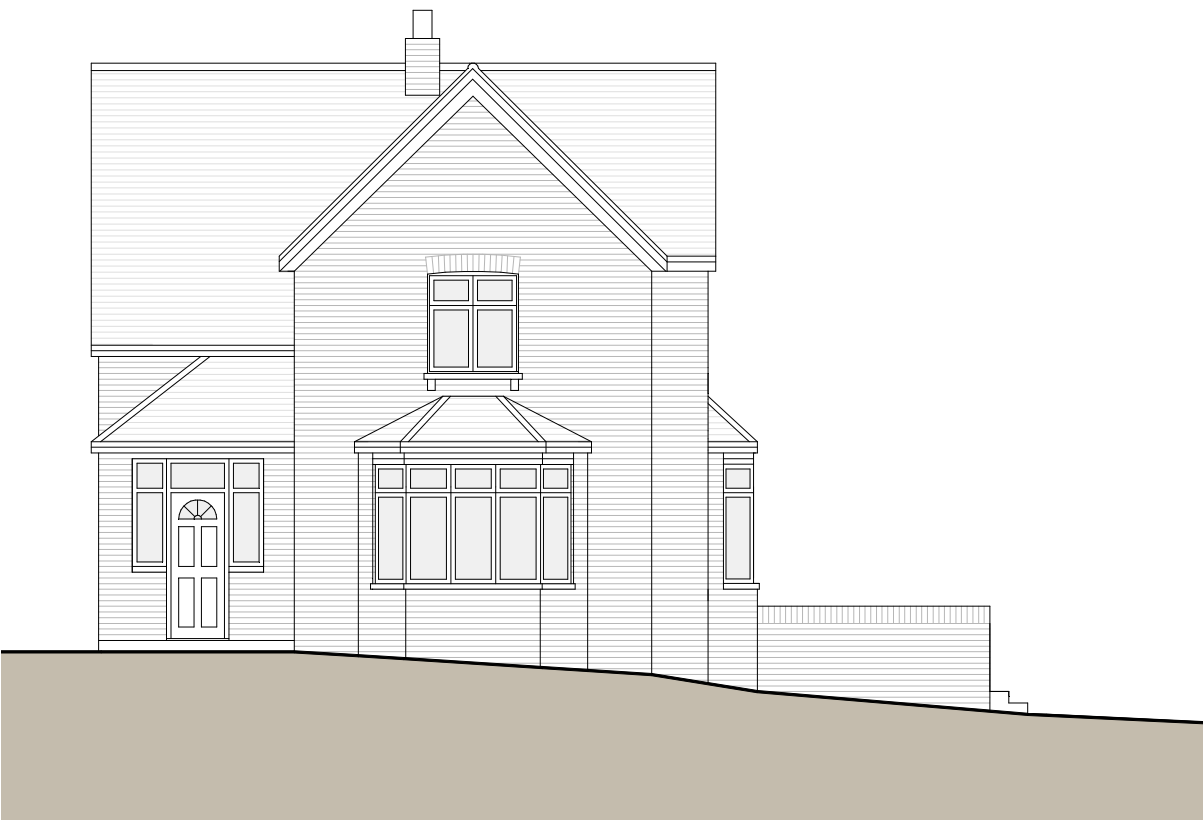
Front Elevation (north)