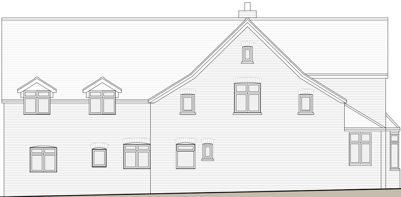
Side Elevation (east)