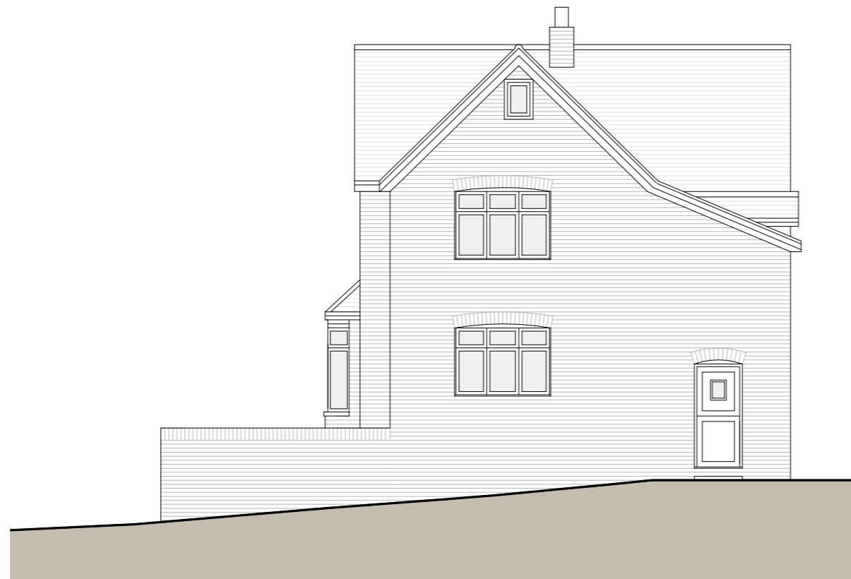
Rear Elevation (south)