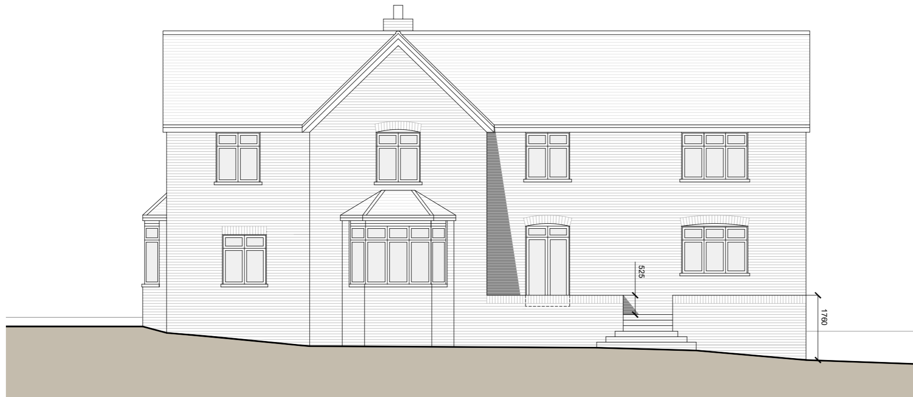
Side Elevation (west)