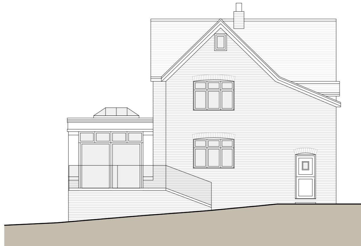
Rear Elevation (south)