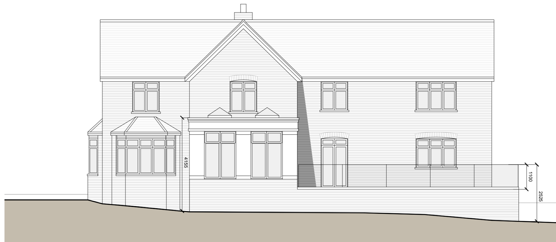
Side Elevation (west)