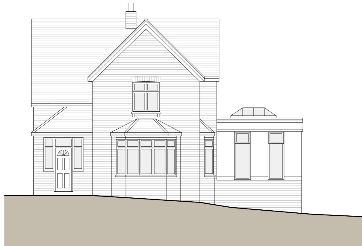
Front Elevation (north)