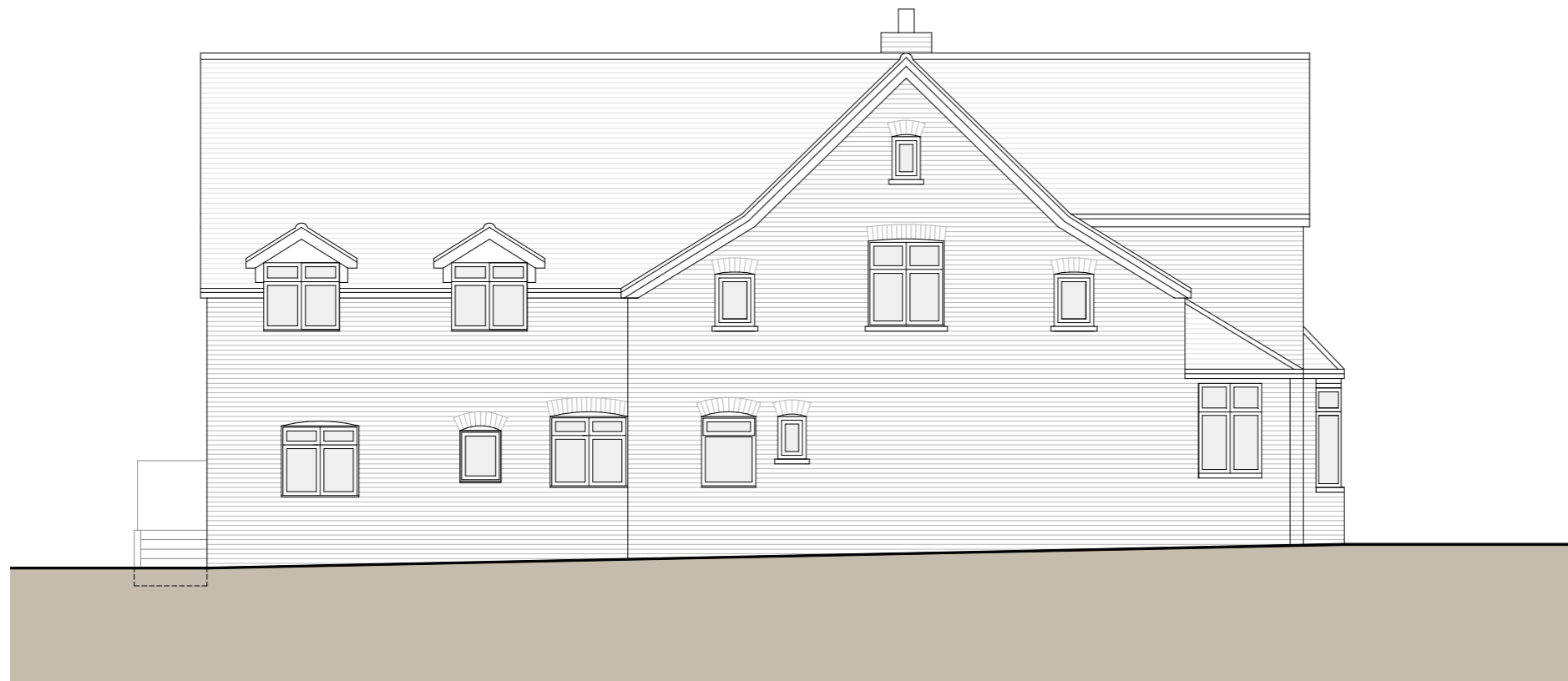
Side Elevation (east)