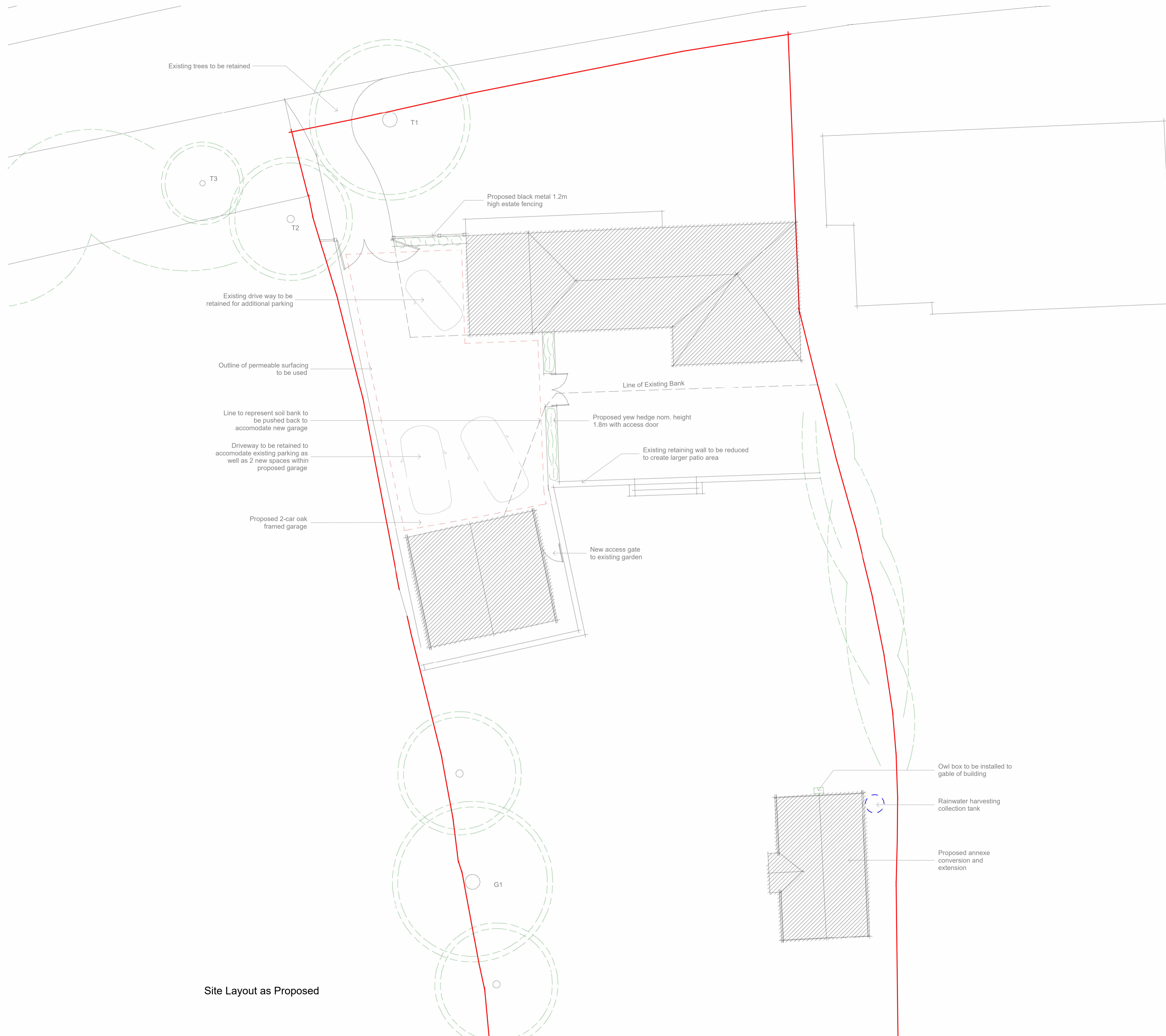
Site Layout as Proposed