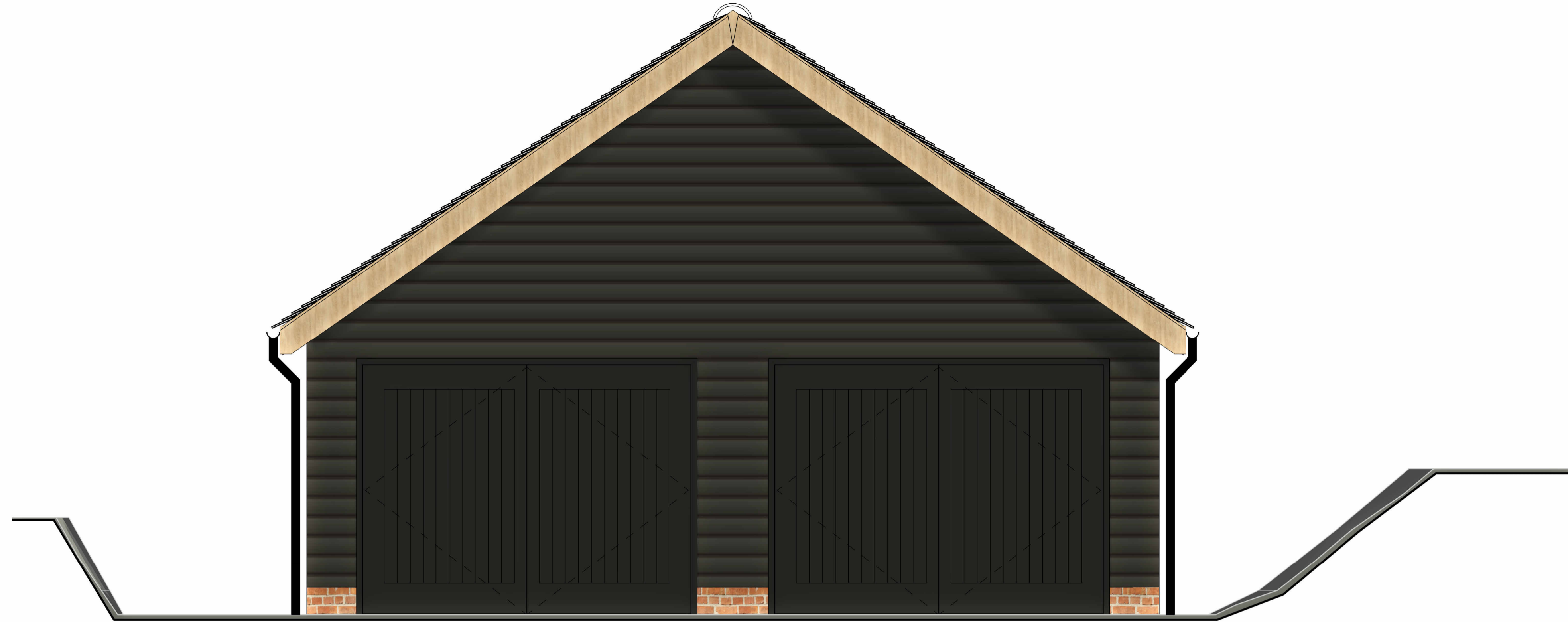
Proposed Garage North Elevation