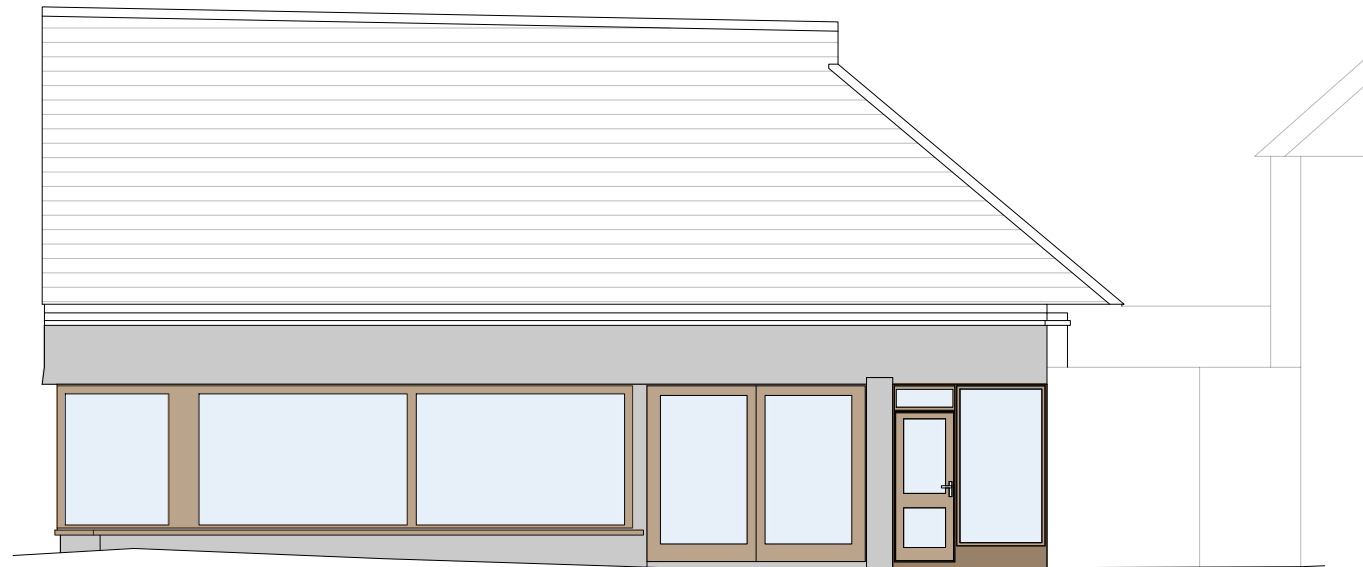
EXISTING SHOWROOM NORTH ELEVATION

All work to be in accordance with the current Building Regulations, all relevant British Standard Code of Practice. Contractor to check all dimensions on site prior to commencement of works.