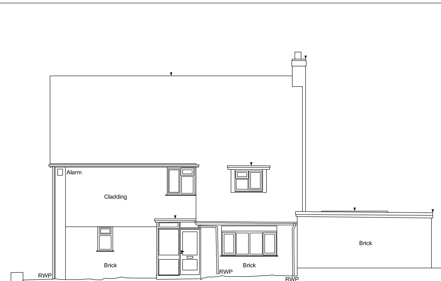
FRONT NORTH ELEVATION